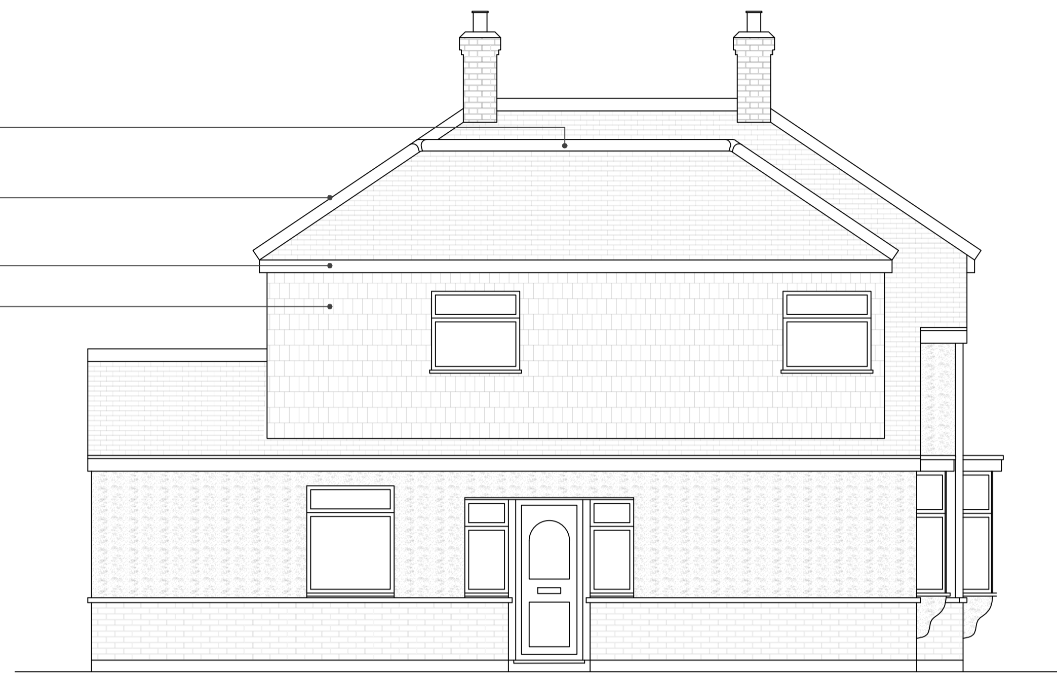
PROPOSED SIDE ELEVATION 1:50