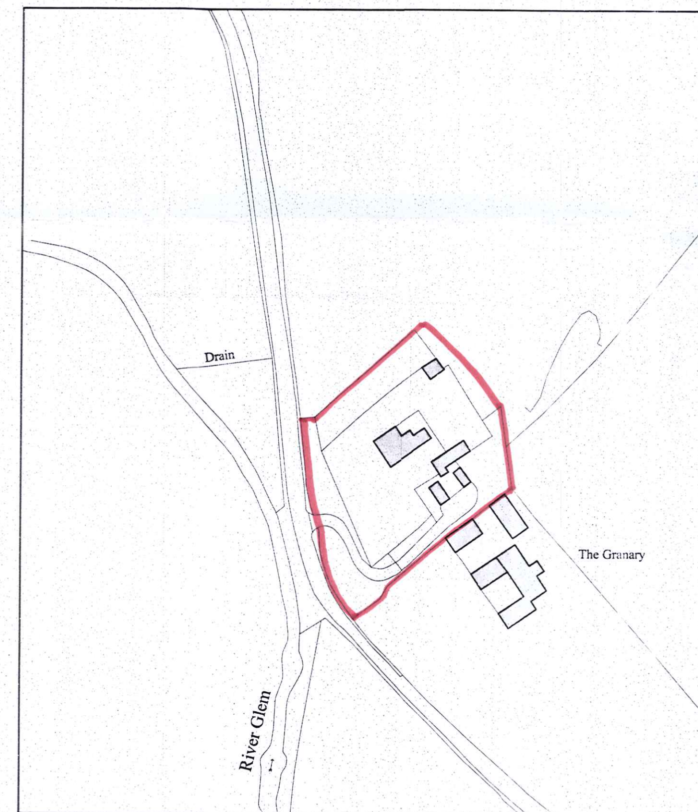
LOCATION PLAN 1/1250 @ A1