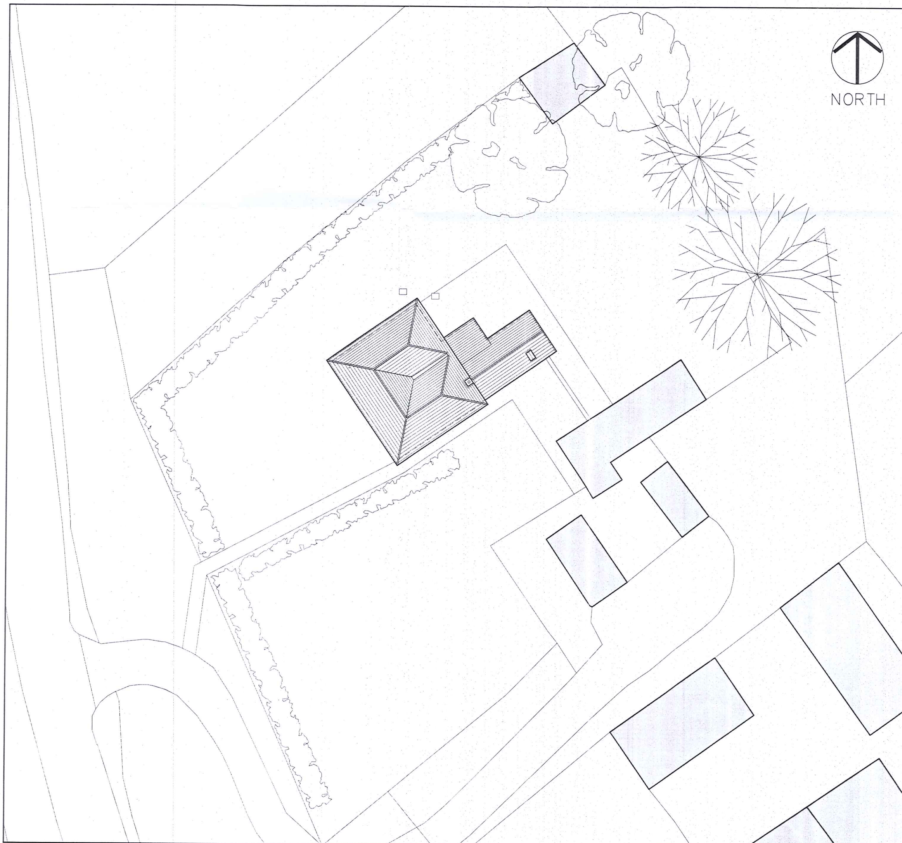
SITE PLAN 1/200 @ A1