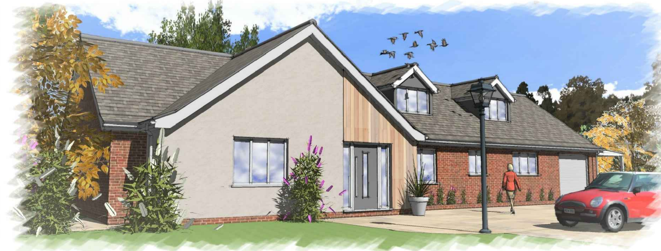
FRONT - NORTH-EAST VIEW