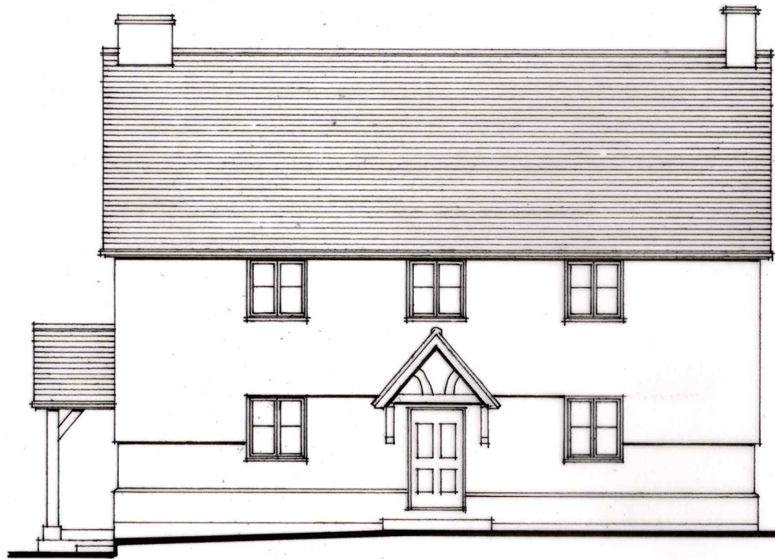
south east. 1:100.