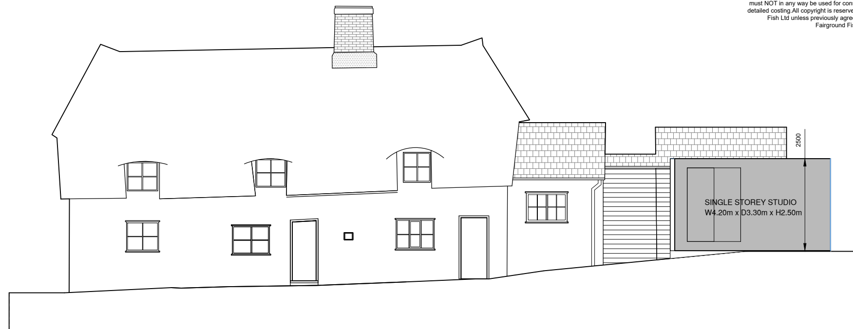
2 1 0.5 0 southern elevation