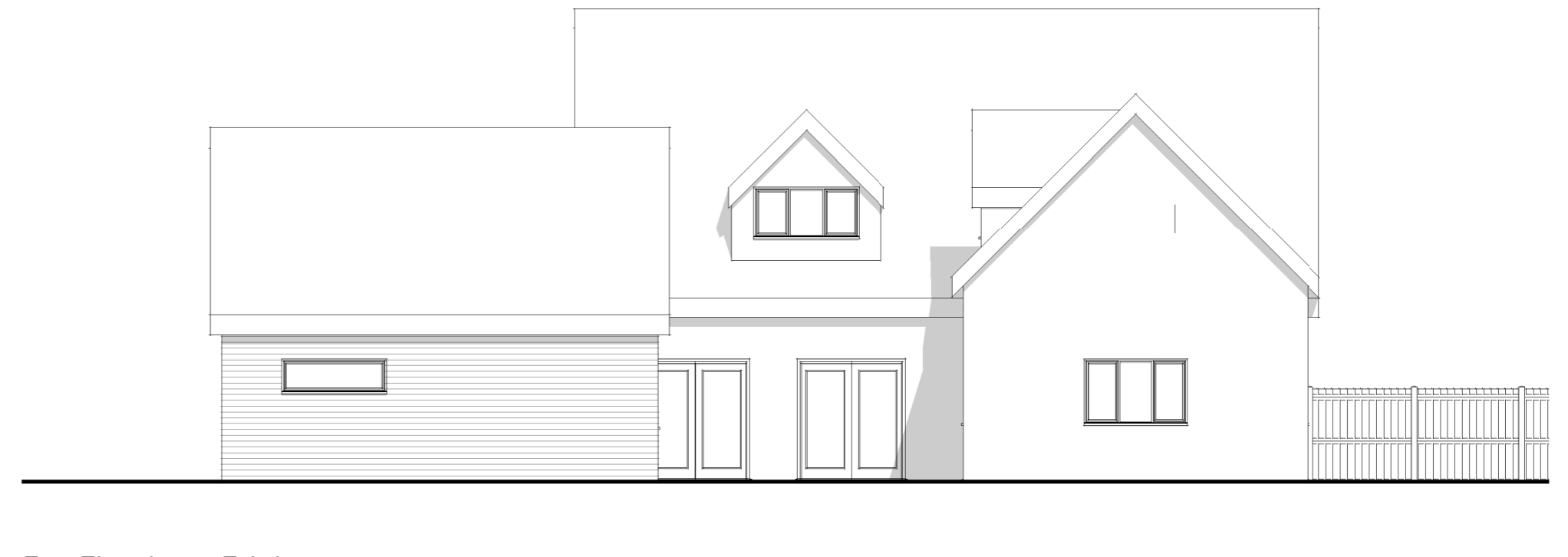
East Elevation as Existing 1:100