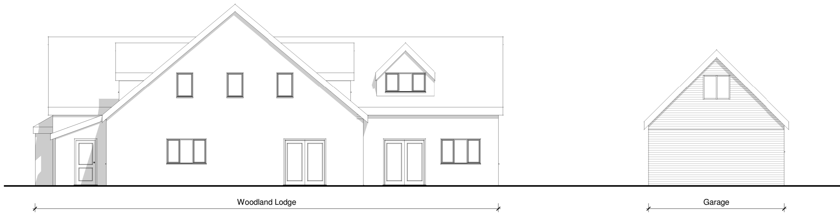
South Elevation as Existing 1:100

NO DIMENSIONS TO BE SCALED FROM THIS DRAWING