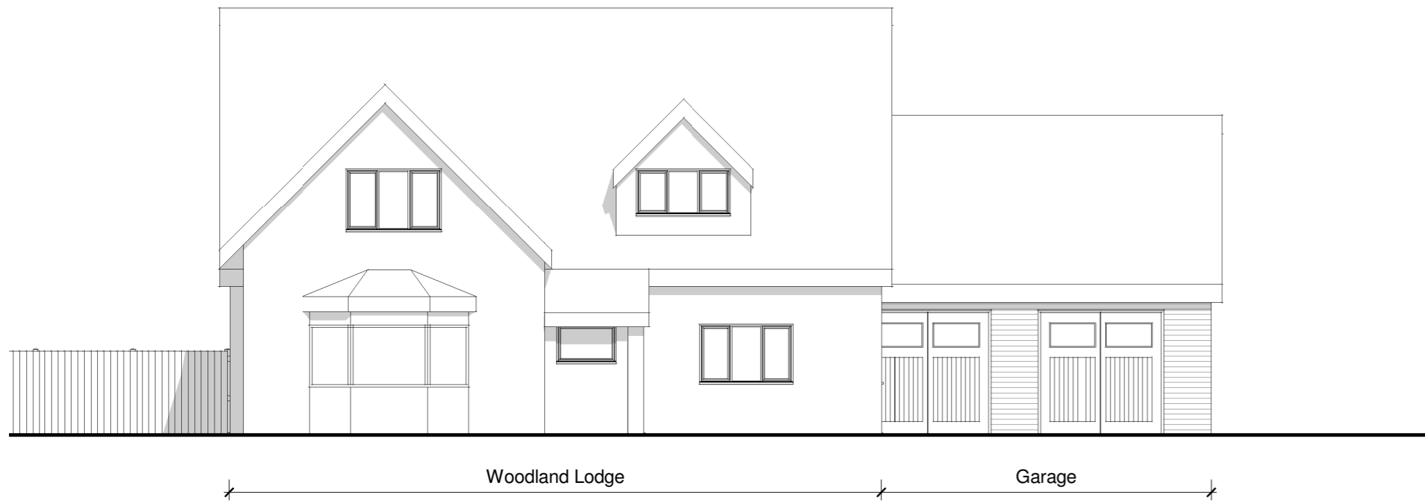
West Elevation as Existing 1:100