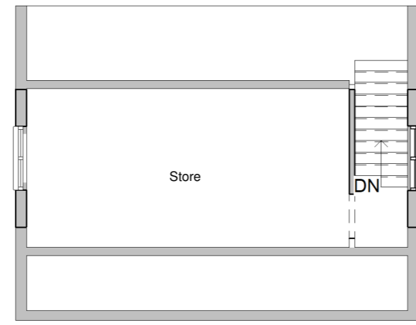
First Floor as Existing 1:100