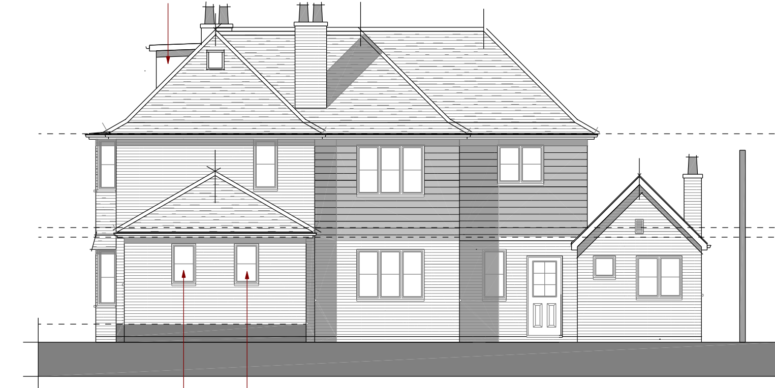
PROPOSED SIDE ELEVATION - EAST

OMITT SINGLE HIGH LEVEL WINDOW, ADD 2 NO. NEW WINDOWS