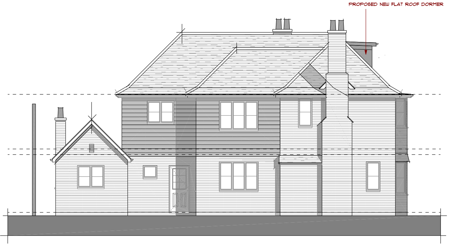
PROPOSED SIDE ELEVATION - WEST

FRENCH DOORS AND SMALL SIDE WINDOW OMITTED - NEW WINDOW ADDED