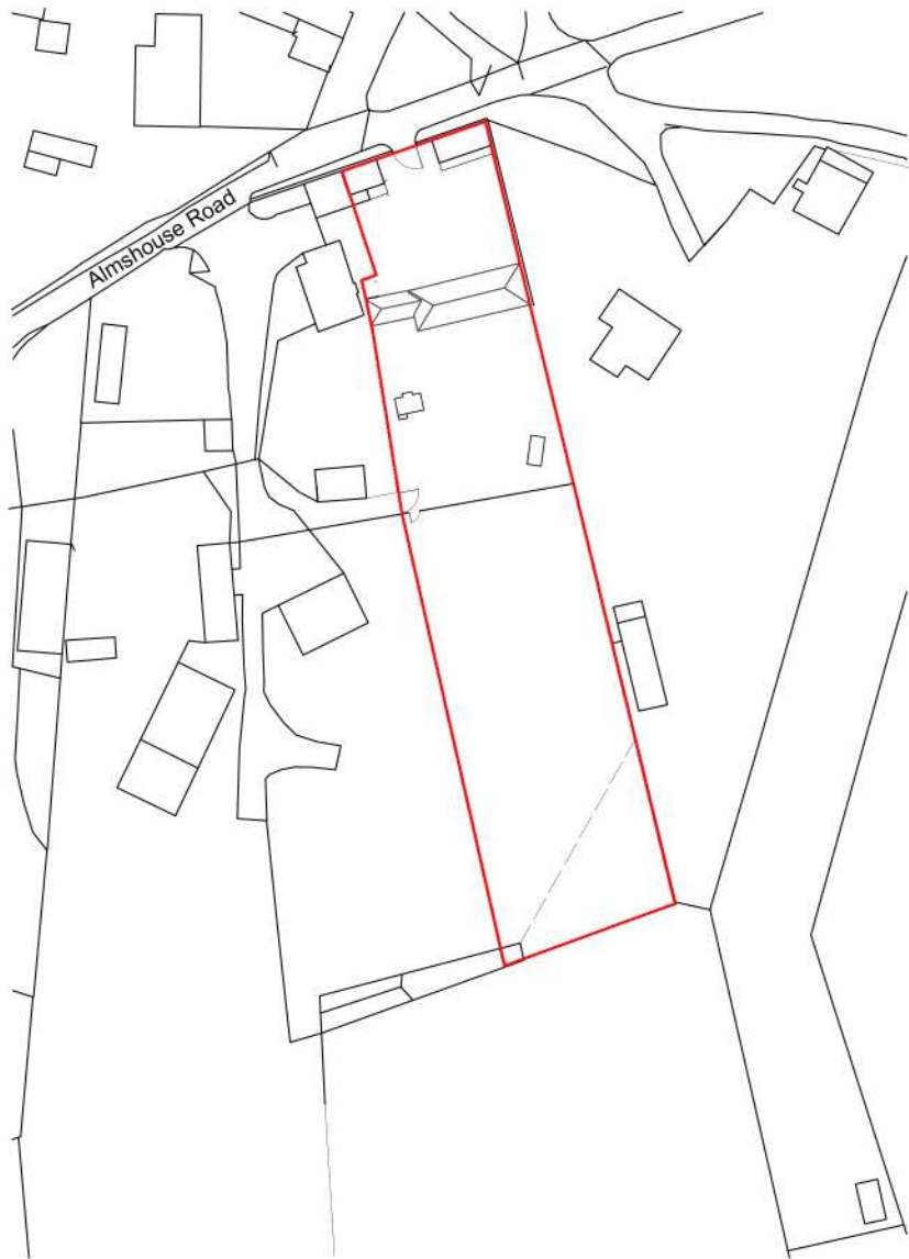
Proposed location plan - 1:1250