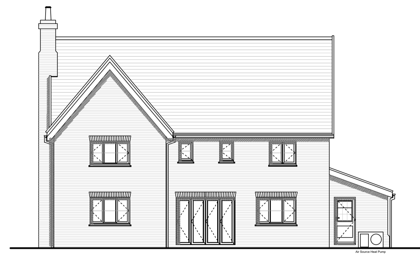
South Elevation 1:100