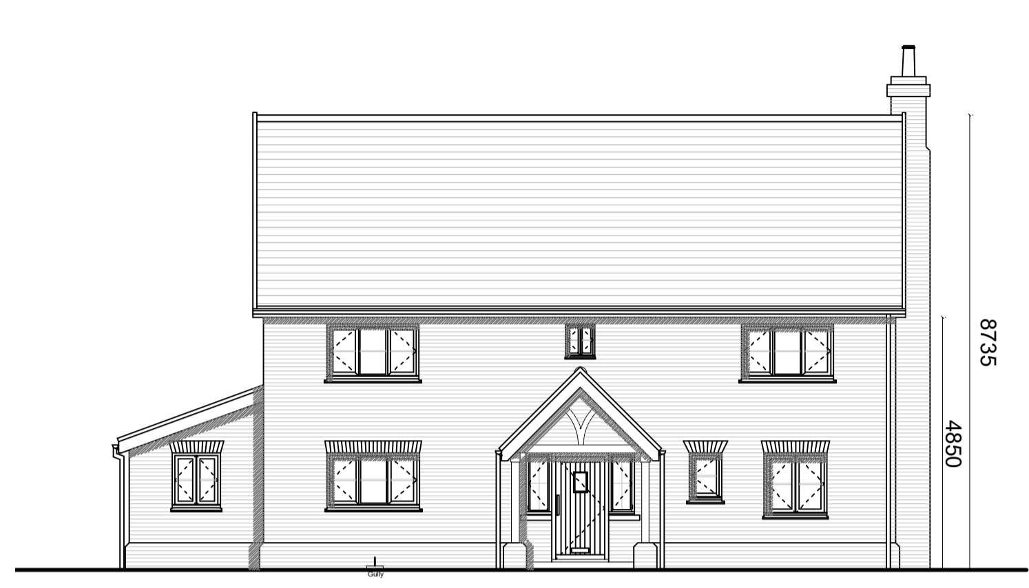
North Elevation 1:100

© This drawing and design are copyright. Do not scale from this drawing. Use only figured dimensions. If in doubt, ask. All dimensions are to be checked on site. Any discrepancies should be reported immediately to the Architect.