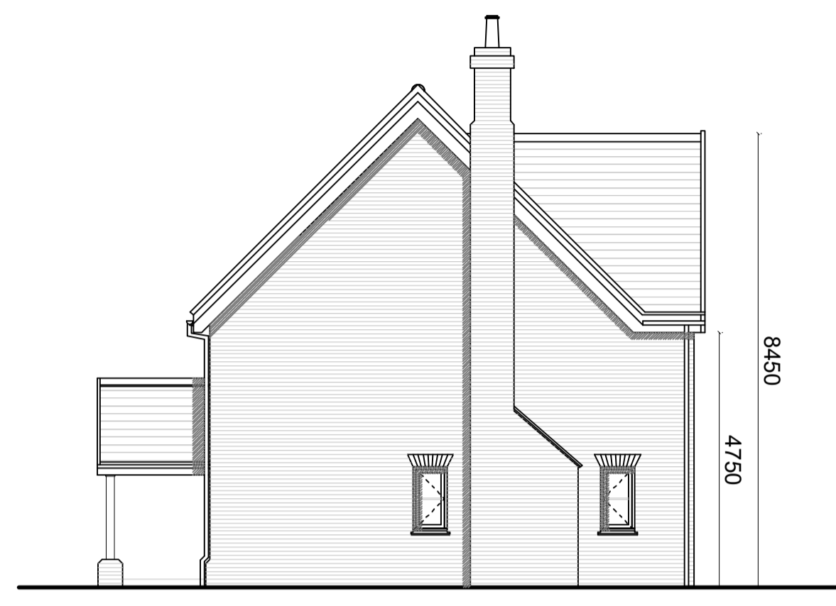
West Elevation 1:100