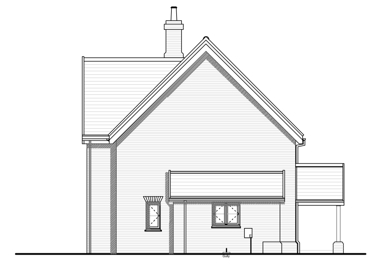
East Elevation 1:100