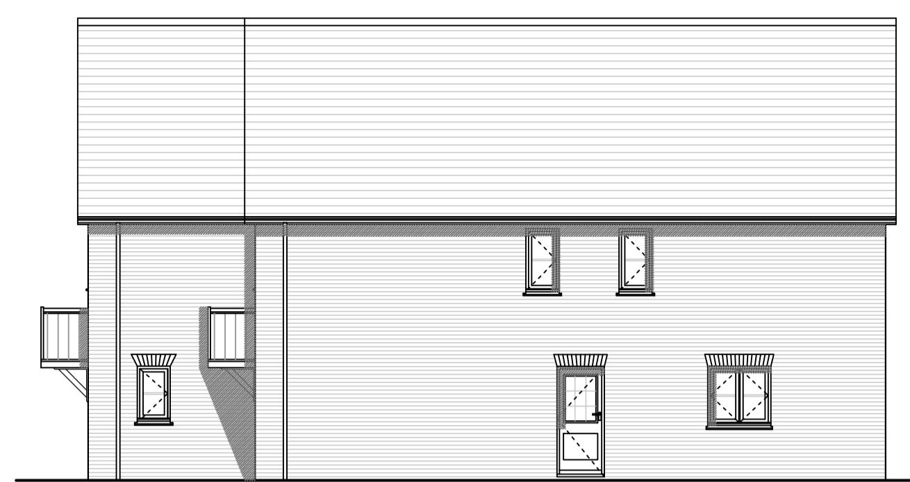
Side Elevation 1:100