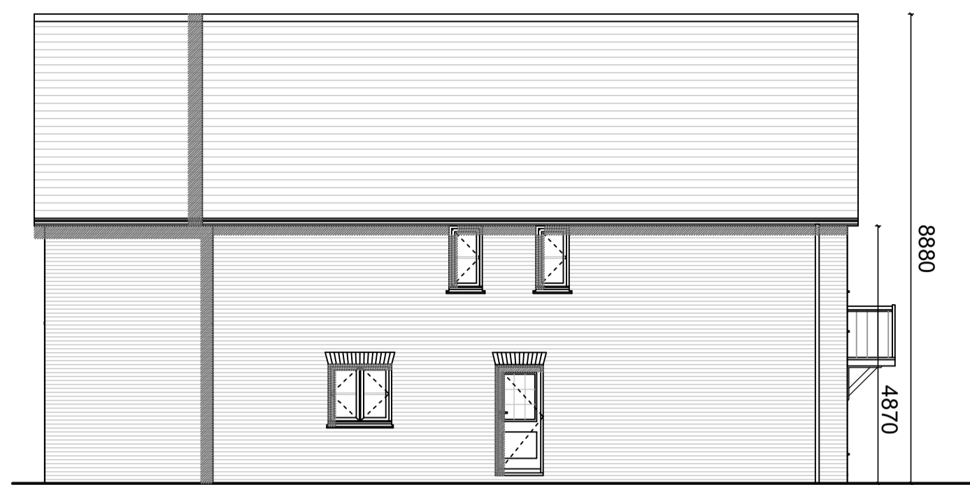
Side Elevation 1:100