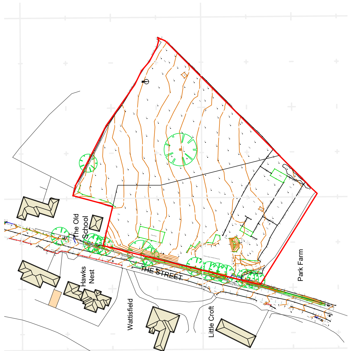
Residential Development at; Land at Wattisfield, The Street, Wattisfield, Suffolk Site Location Plan Scale 1:1250 (A4)