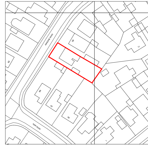
Proposed Location Plan - Scale 1:1250