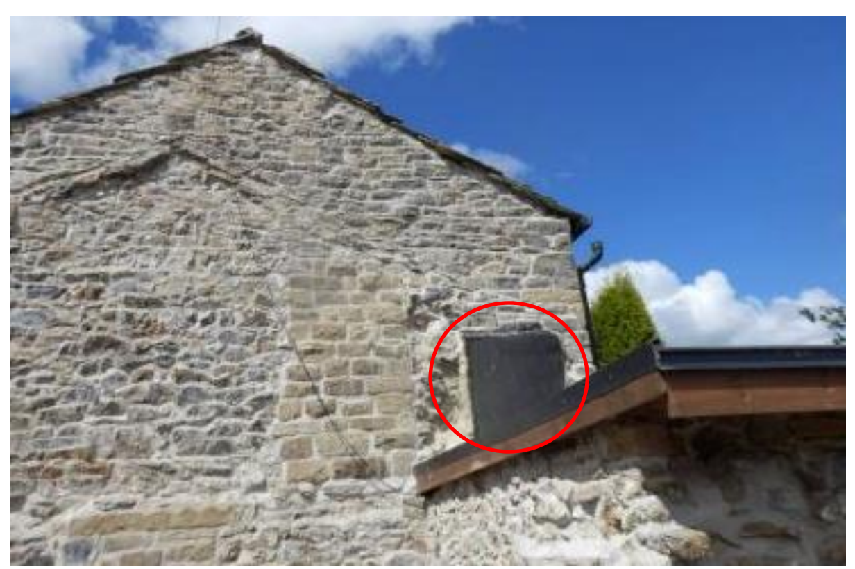
Image 3 View of infilled hole in the party wall when exposed following demolition of Nuttercote Farm.