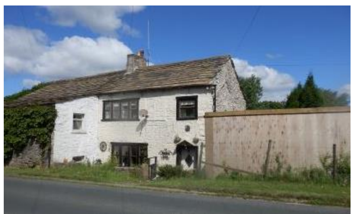
Image 1 Nuttercote Cottage as at June 2018. Nuttercote Farm was to the right of the property before its demolition.