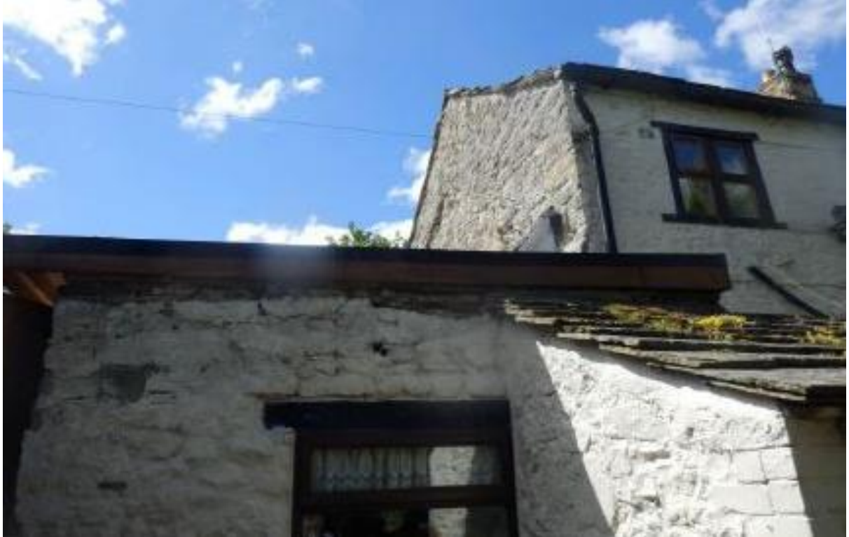
Image 4 Lean to and rear of the Dining Room with temporary roof over above.