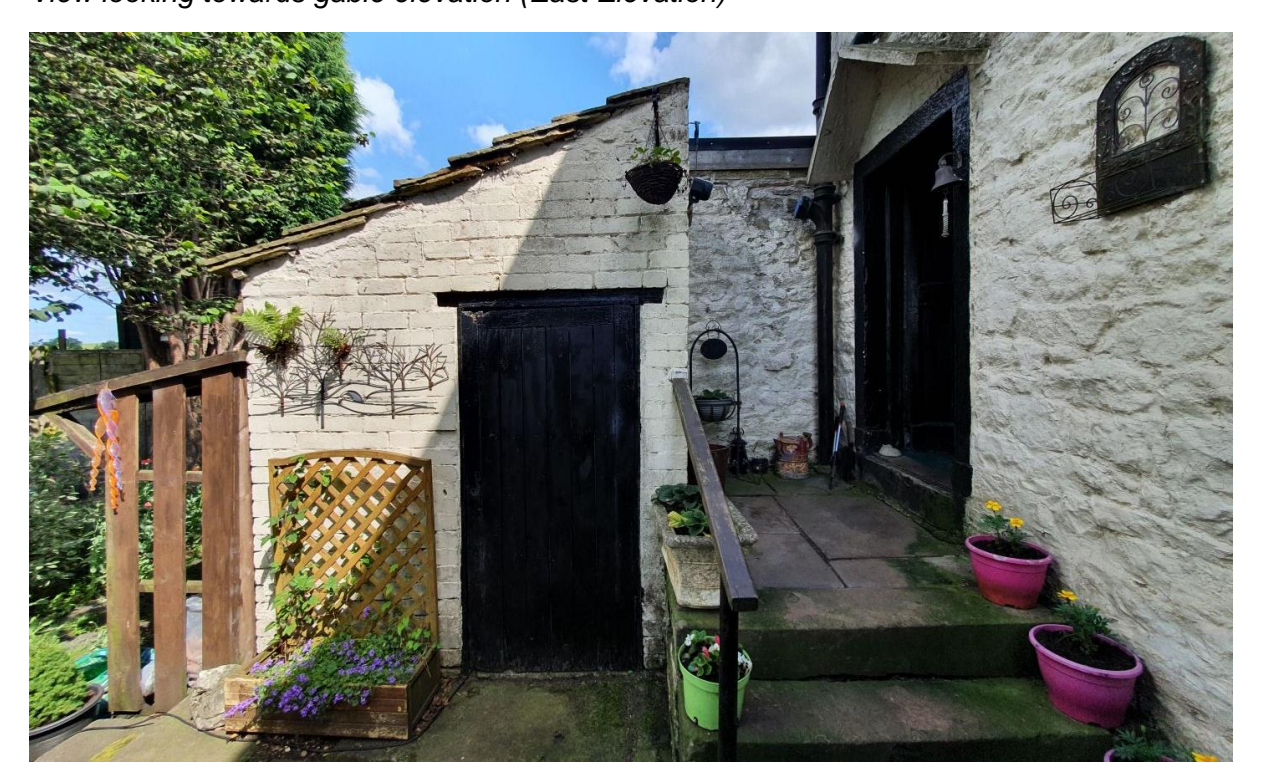
View looking towards the West Elevation