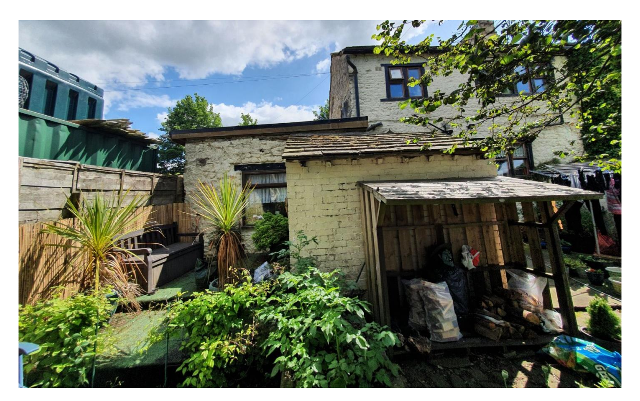
View looking towards North Elevation

Page 14 Date 29/03/22 Heritage Statement