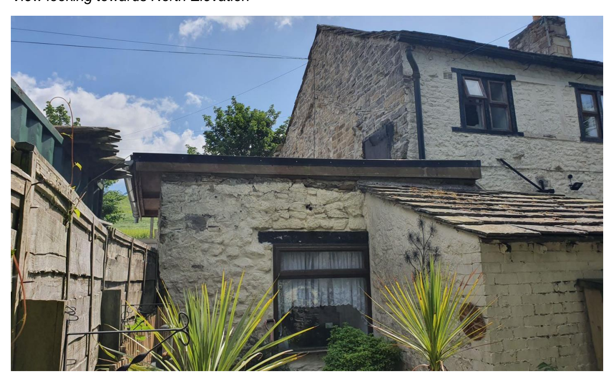
View looking towards North Elevation