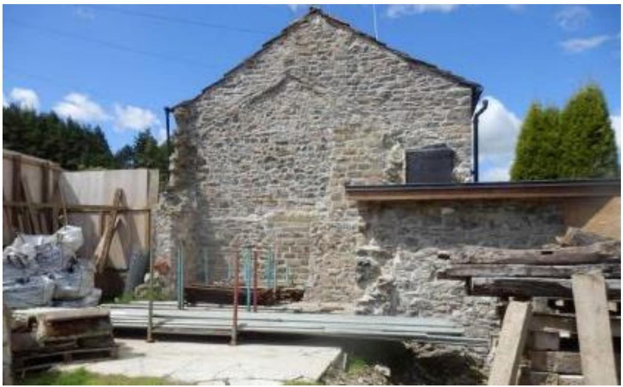
Image 2 Exposed party wall as at 21 June 2018. Dining Room to the property is in the single storey addition to the right of this photograph.