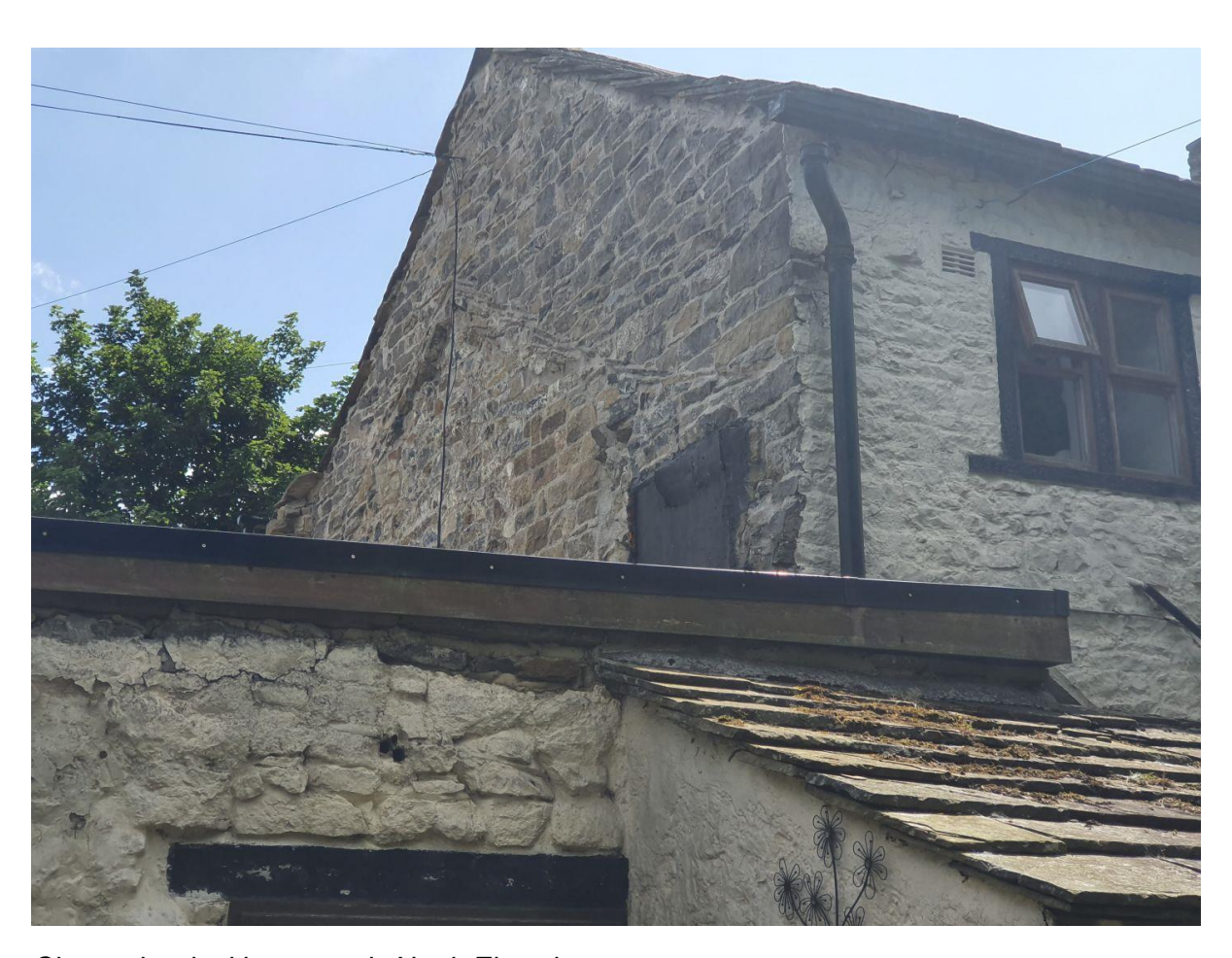
Closer view looking towards North Elevation

Page 15 Date 29/03/22 Heritage Statement