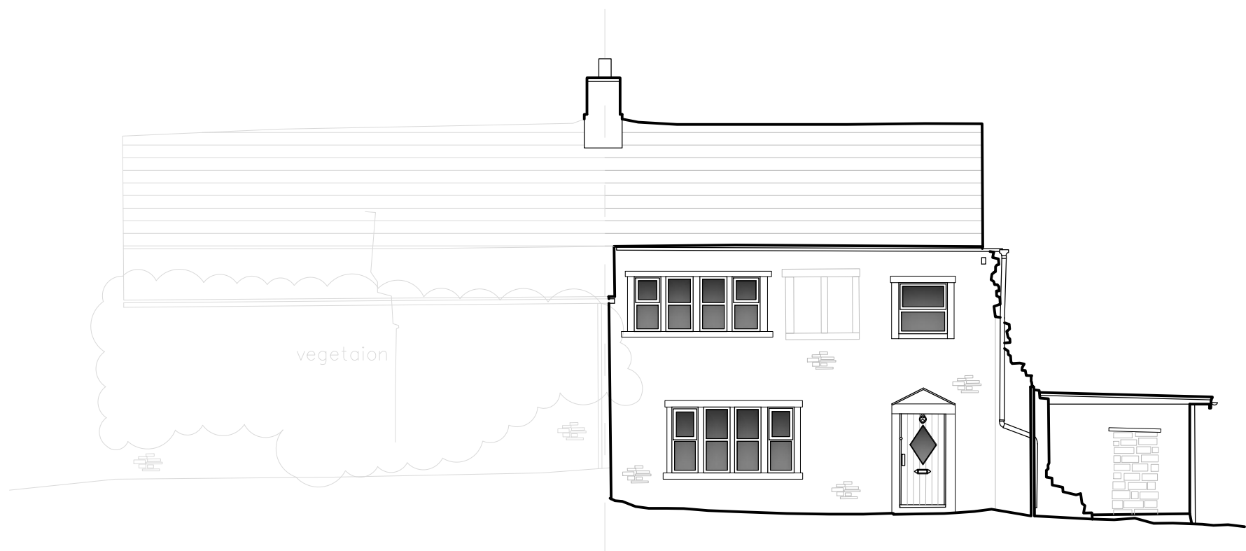
SOUTH ELEVATION AS EXISTING