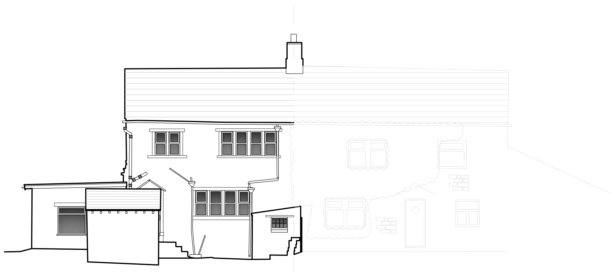
NORTH ELEVATION AS EXISTING