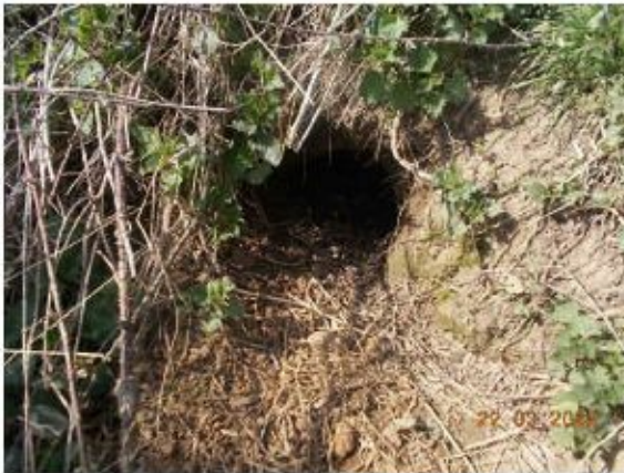
Plate 13: One of the two badger entrance holes which form an outlying sett and are in current use. The sett is located outside of the site boundary and will not be damaged or disturbed by construction on the site, which will take place at a distance of approximately 90m from the sett.

Target Note 1: These are two badger entrance holes in current use (forming an outlying sett which is off-site) (see Plate 13)