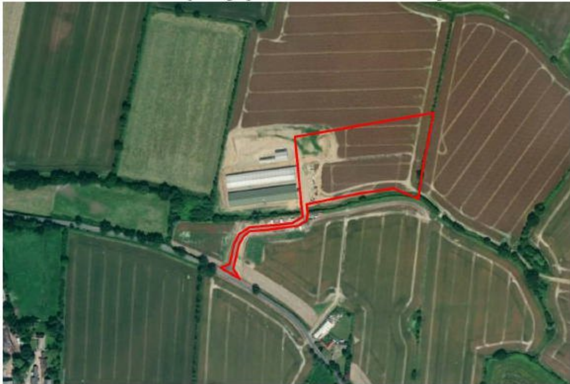
Plate 1: Aerial photograph of the site and surrounding land

Based upon Ordnance Survey ©Crown Copyright, under licence 1000058410, unauthorised reproduction infringes Crown Copyright and may lead to prosecution or civil proceedings.