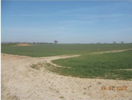
Plate 4: a view of the arable land which covers most of the site. Photograph taken from the south-east corner of the site looking north-west.