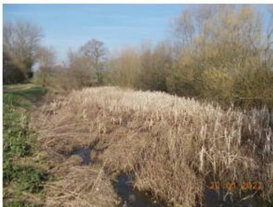
Plate 11: Pond 1, located approximately 192m south-east of the development site and assessed to have 'poor' habitat suitability for great crested newts, mainly because it is obviously polluted by agricultural run-off.

Ponds: There are no ponds on the site and five ponds within 500m of the site marked on Ordnance Survey maps. Two of the ponds were not accessible during the survey. One other pond is no longer a pond, being dry and overgrown. The remaining two ponds (see Plates 11 and 12) have been assessed to have 'poor' habitat suitability for great crested newts (refer also to the Great Crested Newts section below and Table 4 in Appendix 1 for details of the survey results).