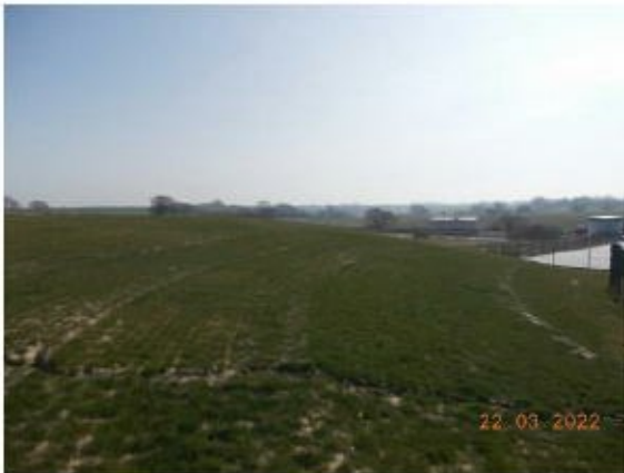
Plate 8: another view of the improved grassland in the north-western part of the site. Photograph taken from the north.

Broadleaved Plantation Woodland: This habitat is found on a small part of the site's southern boundary (see Figure 2 and Plate 9). The woodland has been recently planted. Tree and bush species recorded in the woodland are shown in Table 1 in Appendix 1. They include only widespread and common species. It has been judged to have negligible potential to support roosting bats as no bat roosting features were observed. All of the woodland will remain undamaged and in situ during the project.