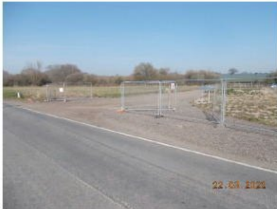
Plate 2: the junction of the existing farm access road and Oakley Road. Photograph taken from the south-east.

Access to the Site: The project will use the existing farm access road (see Plates 1, 2 and 3) which joins the highway (Oakley Road) to the south-west of the site. The current access road consists of hard-core along its full length.