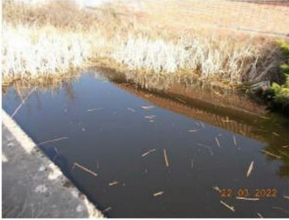
Plate 12: Pond 2, located approximately 214m south of the development site and assessed to have 'poor' habitat suitability for great crested newts, mainly because it is located next to a road and has poor habitats around it.