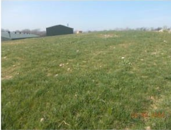
Plate 7: a view of the recently sown improved grassland in the north-western part of the site. Photograph taken from the east.