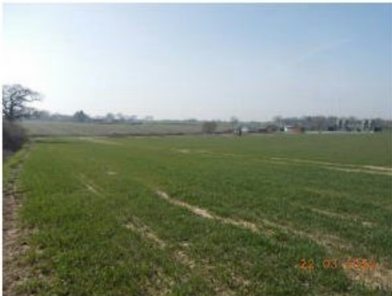
Plate 5: another view of the arable land on the site. Photograph taken from the north-east corner of the site looking south-west.

Arable Field Margins: This habitat is present as a narrow margin (c0.5m) on the site's eastern boundary (too narrow to map, see Plate 6). Plant species recorded in the margin are shown in Table 1 in Appendix 1. They include only widespread and common species.