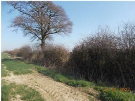
Plate 10: a view of the hedgerow on the site's eastern boundary. Photograph taken from the south. It has been assessed according to the Hedgerows Regulations, 1997 as 'not important'. It has also been judged to have negligible potential to support roosting bats. All of the hedgerow will remain undamaged and in situ during the project.

with a ditch. The woody species present in this hedge include blackthorn, elder, goat willow, hawthorn, pedunculate oak and dog rose. Plant species recorded in the hedge are shown in Table 1 in Appendix 1. They include only widespread and common species. The hedge has been assessed as 'not important' according to the Hedgerows Regulations, 1997 (see Table 2 in Appendix 1). It has been judged to have negligible potential to support roosting bats as no bat roosting features were observed. All of the hedgerow will remain undamaged and in situ during the project.