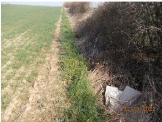
Plate 6: a view of the narrow arable field margin on the site's eastern boundary. Photograph taken from the south.

Arable Field Margins: This habitat is present as a narrow margin (c0.5m) on the site's eastern boundary (too narrow to map, see Plate 6). Plant species recorded in the margin are shown in Table 1 in Appendix 1. They include only widespread and common species.