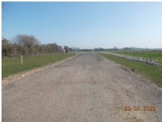
Plate 3: a section of the current farm access road to the south-west of the site. Photograph taken from the west.

Arable Land: This habitat is present over most of the site (see Figure 2 and Plates 4 and 5). At the time of survey, it was under a cereal crop.