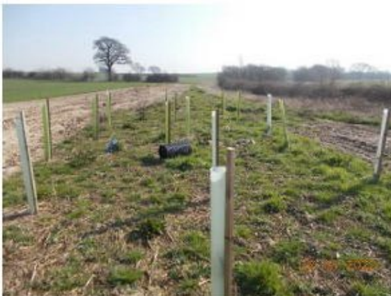
Plate 9: a view of the small recently planted area of plantation woodland on the site. Photograph taken from the west. It has been judged to have negligible potential to support roosting bats as no bat roosting features were observed. All of the woodland will remain undamaged and in situ during the project.

Broadleaved Plantation Woodland: This habitat is found on a small part of the site's southern boundary (see Figure 2 and Plate 9). The woodland has been recently planted. Tree and bush species recorded in the woodland are shown in Table 1 in Appendix 1. They include only widespread and common species. It has been judged to have negligible potential to support roosting bats as no bat roosting features were observed. All of the woodland will remain undamaged and in situ during the project.