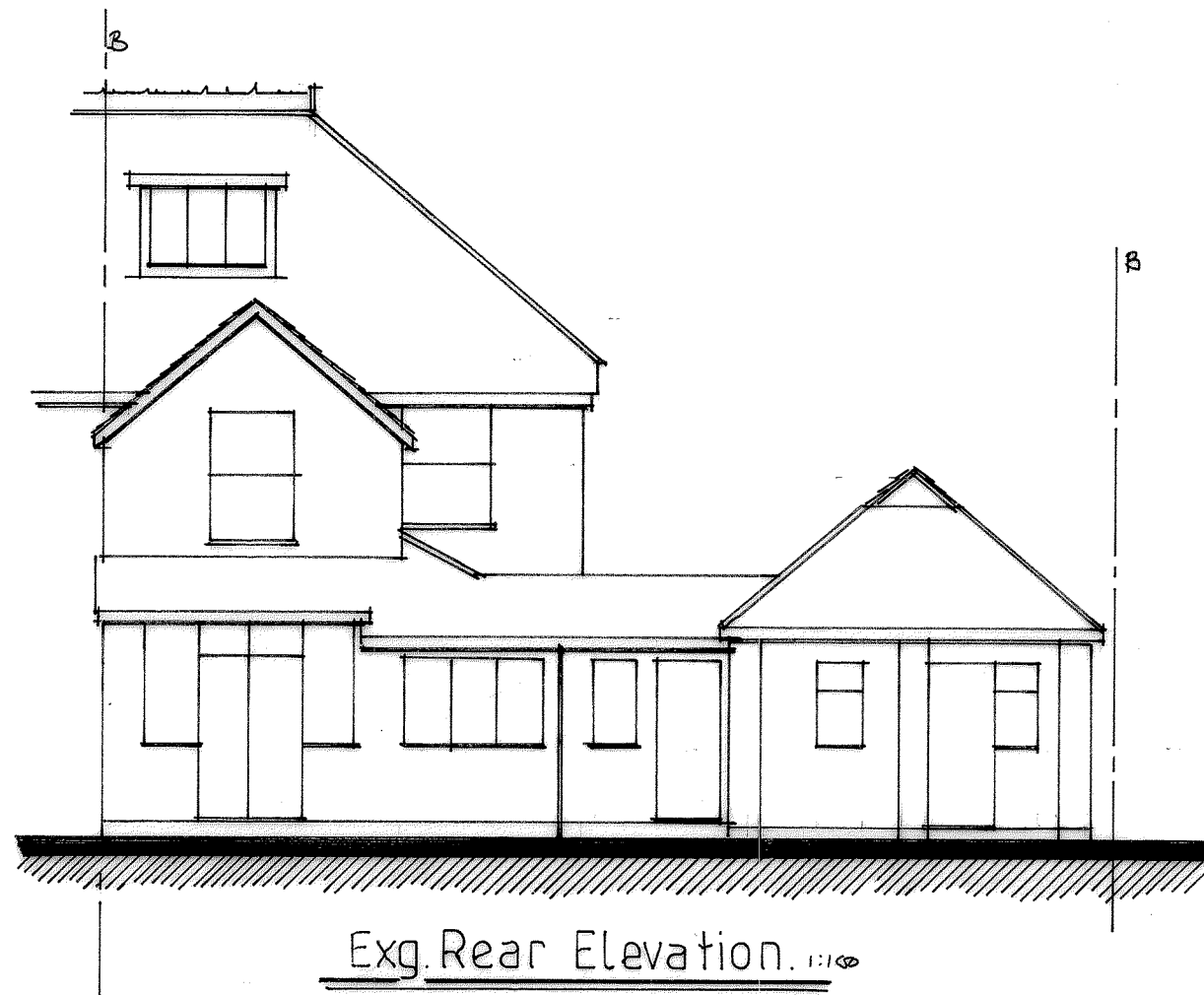
Exg. Rear Elevation. 1:100