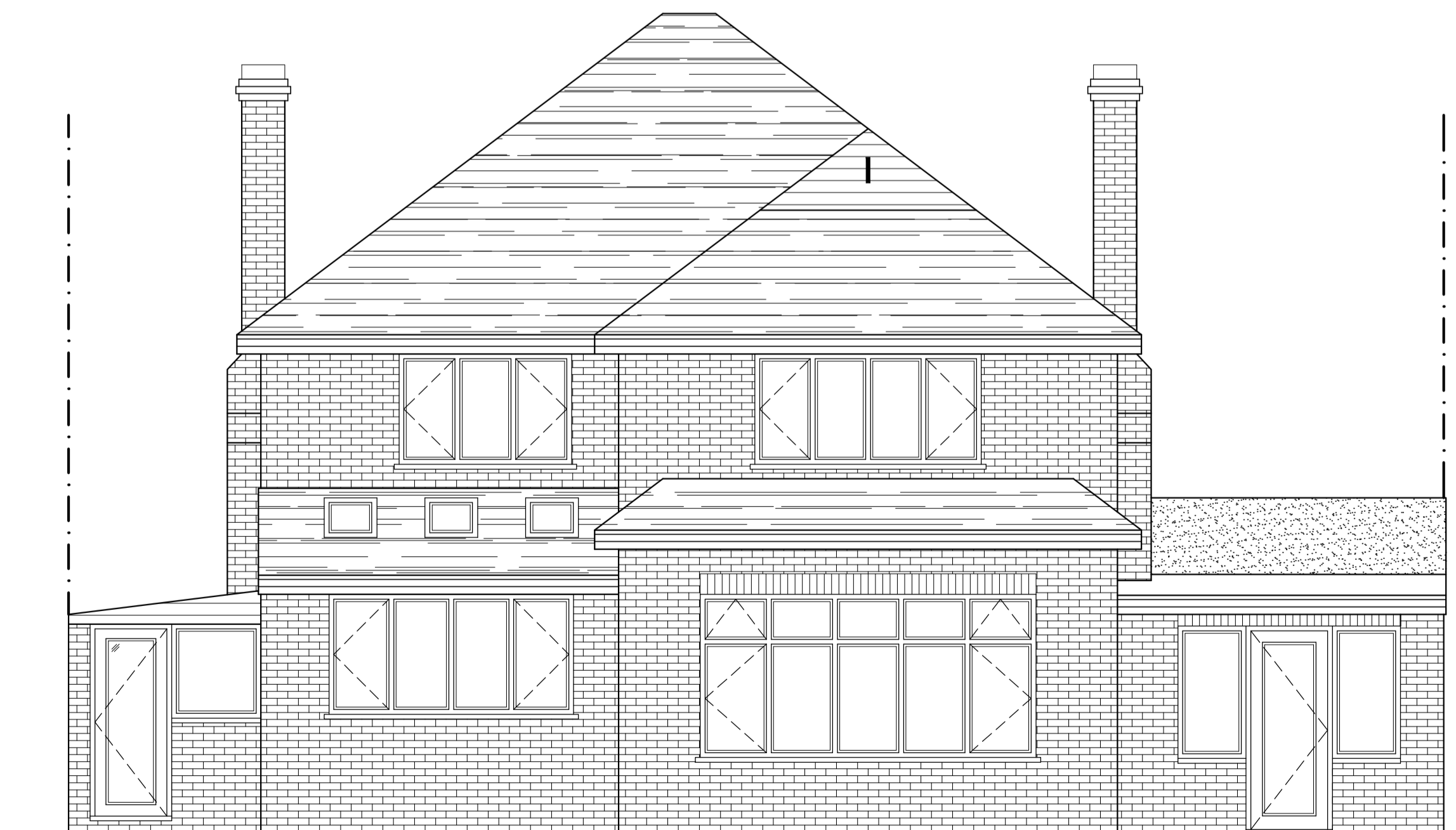
EXISTING REAR ELEVATION SCALE 1:50