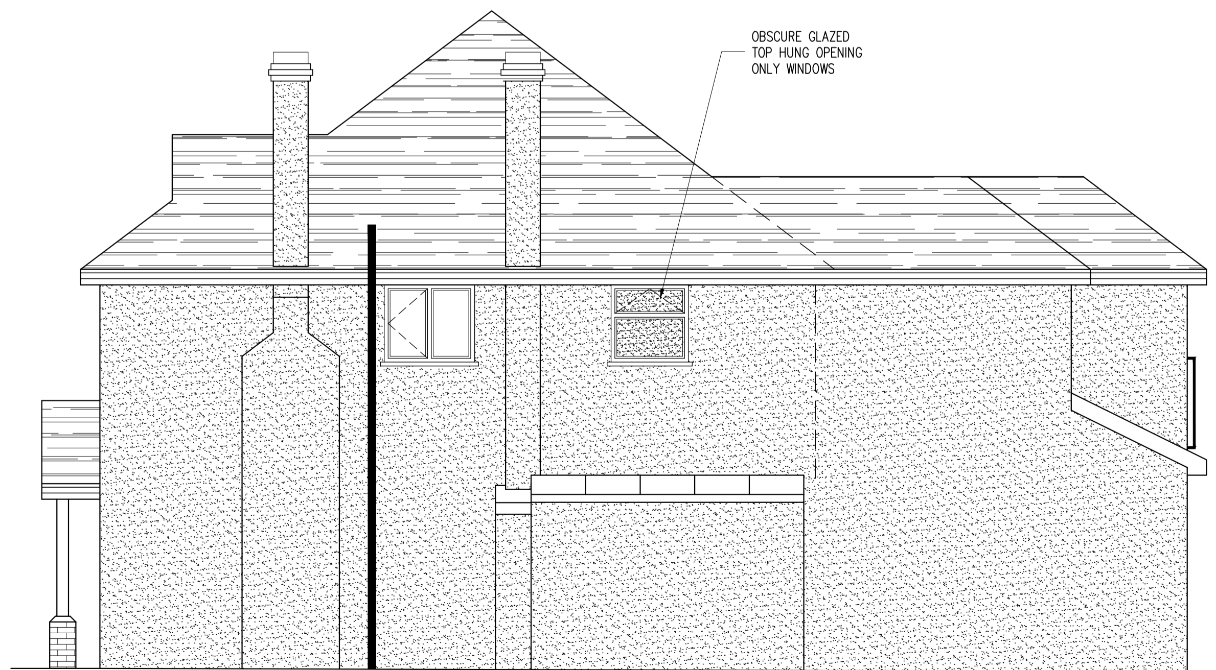
PROPOSED SIDE ELEVATION B SCALE 1:50