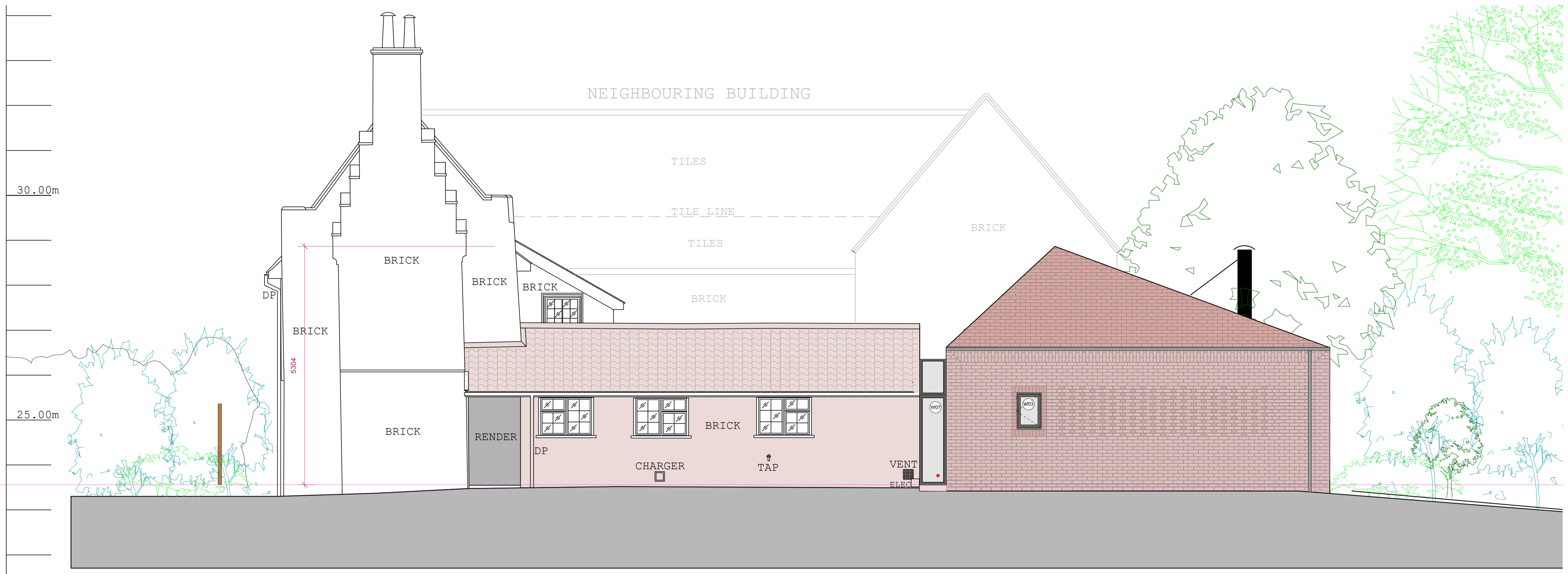
SOUTH ELEVATION - 2