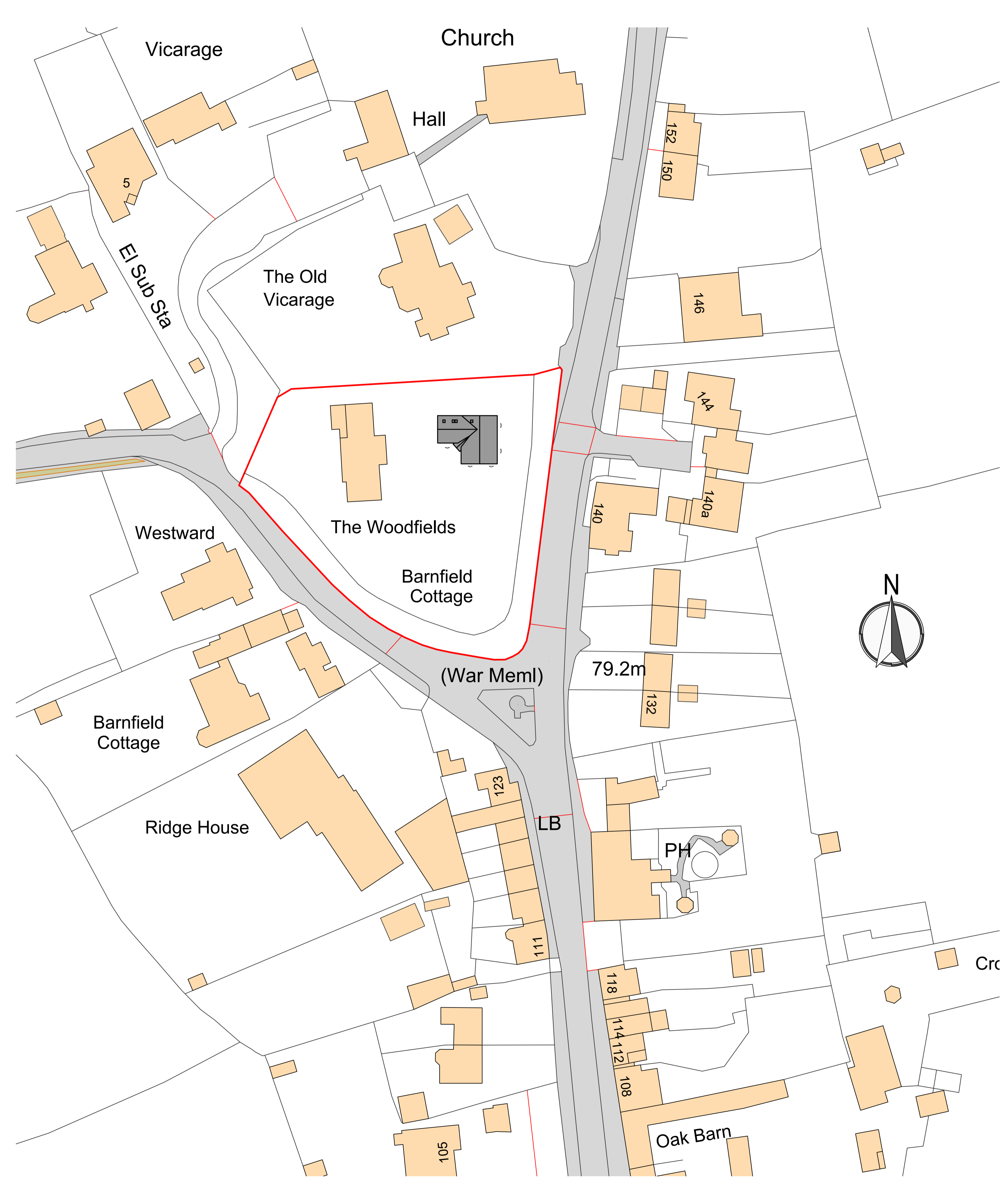
Block Plan [1:500]