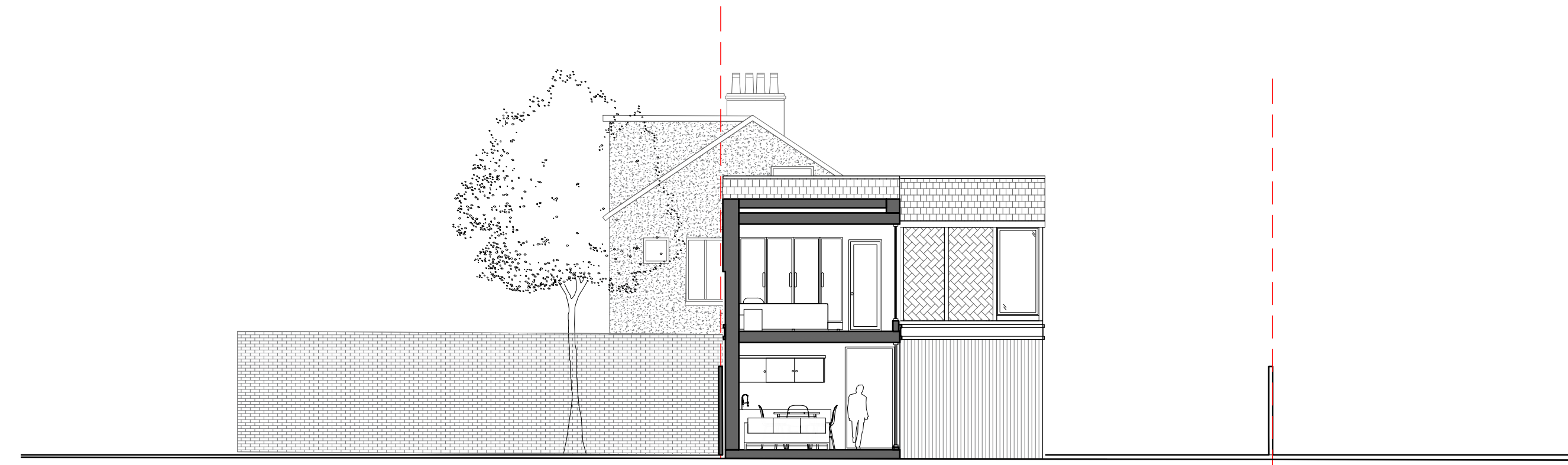
Proposed Section BB Scale 1:100