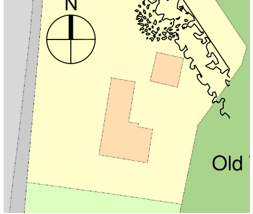
Location plan (not to scale)

Contractors and consultants are not to scale dimensions from this drawing