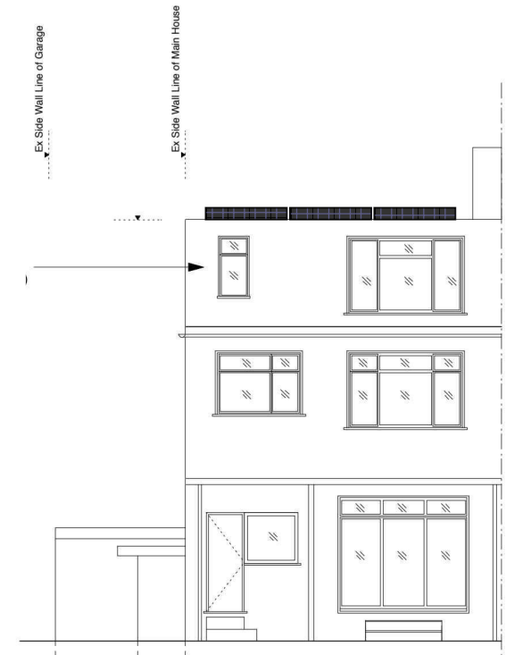
Proposed Rear Elevation v1.0 25 May 2022