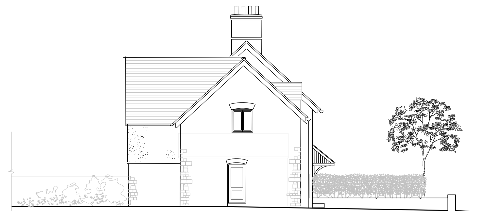
SIDE ELEVATION - NE

MATERIALS : NEW WALLS LOCAL STONE BUFF RENDER ON UPPER STOREY NATURAL GREY/BLACK SLATES COLOURED METAL D/G WINDOWS