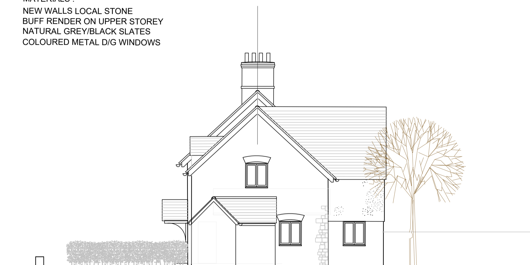
SIDE ELEVATION - SW