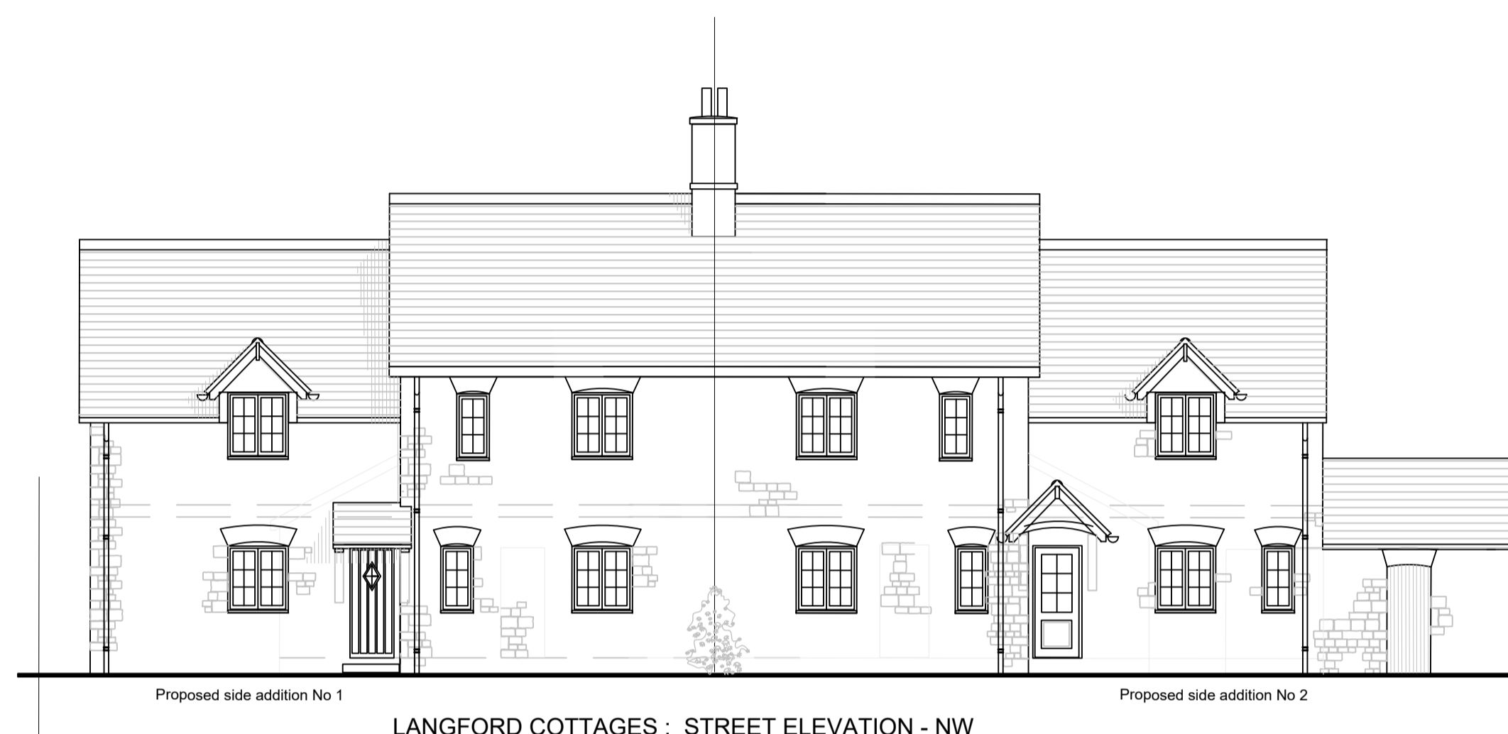
LANGFORD COTTAGES : STREET ELEVATION - NW