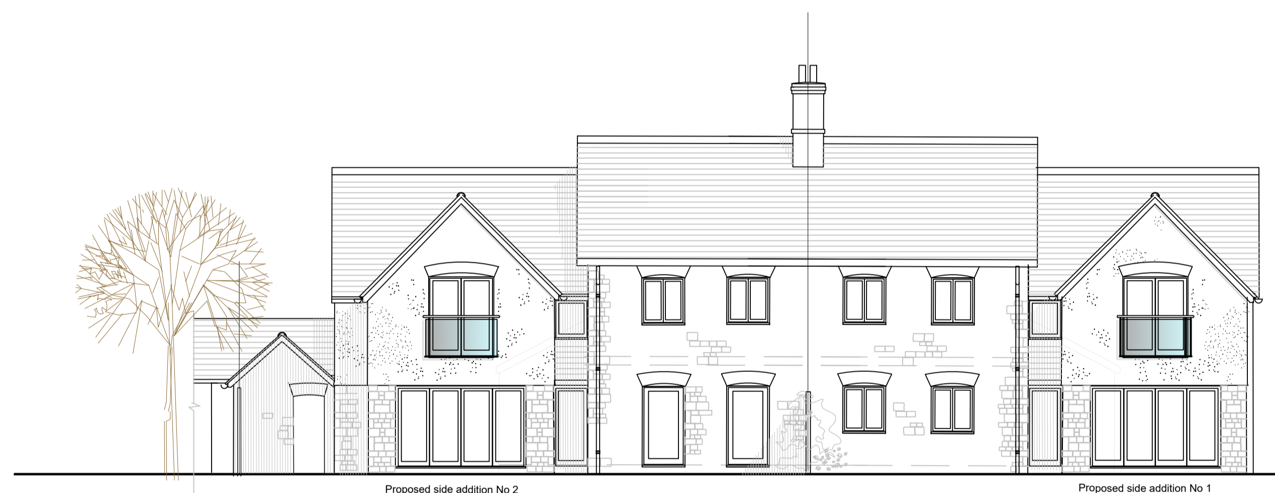
GARDEN ELEVATION - SE

MATERIALS : NEW WALLS LOCAL STONE BUFF RENDER ON UPPER STOREY NATURAL GREY/BLACK SLATES COLOURED METAL D/G WINDOWS