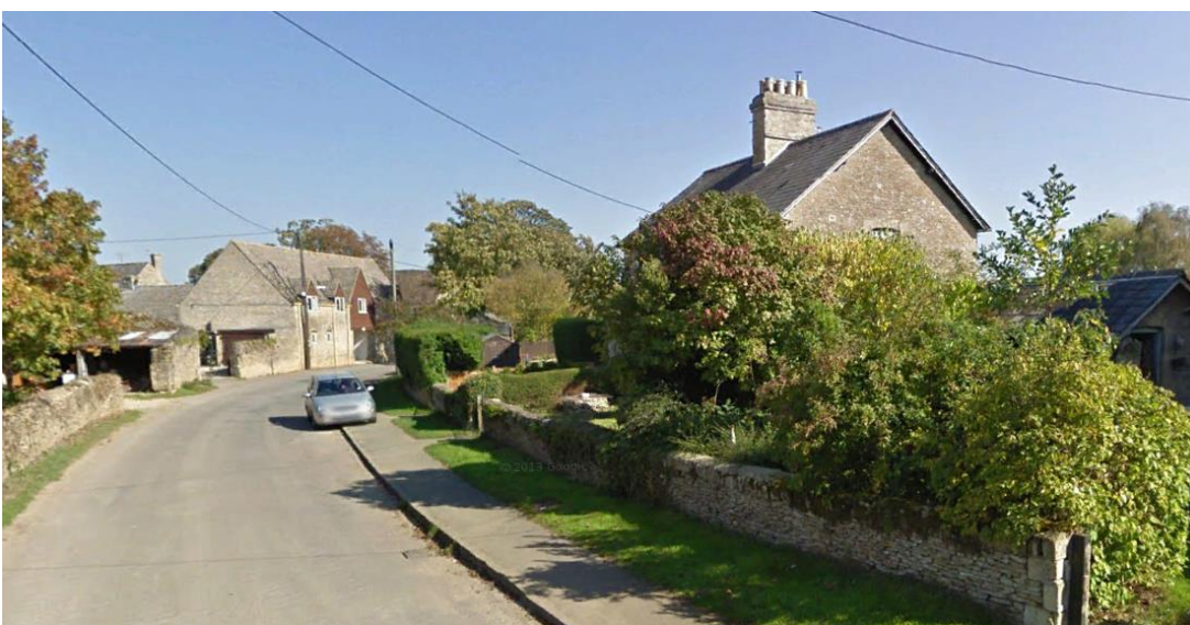
Lechlade Road View