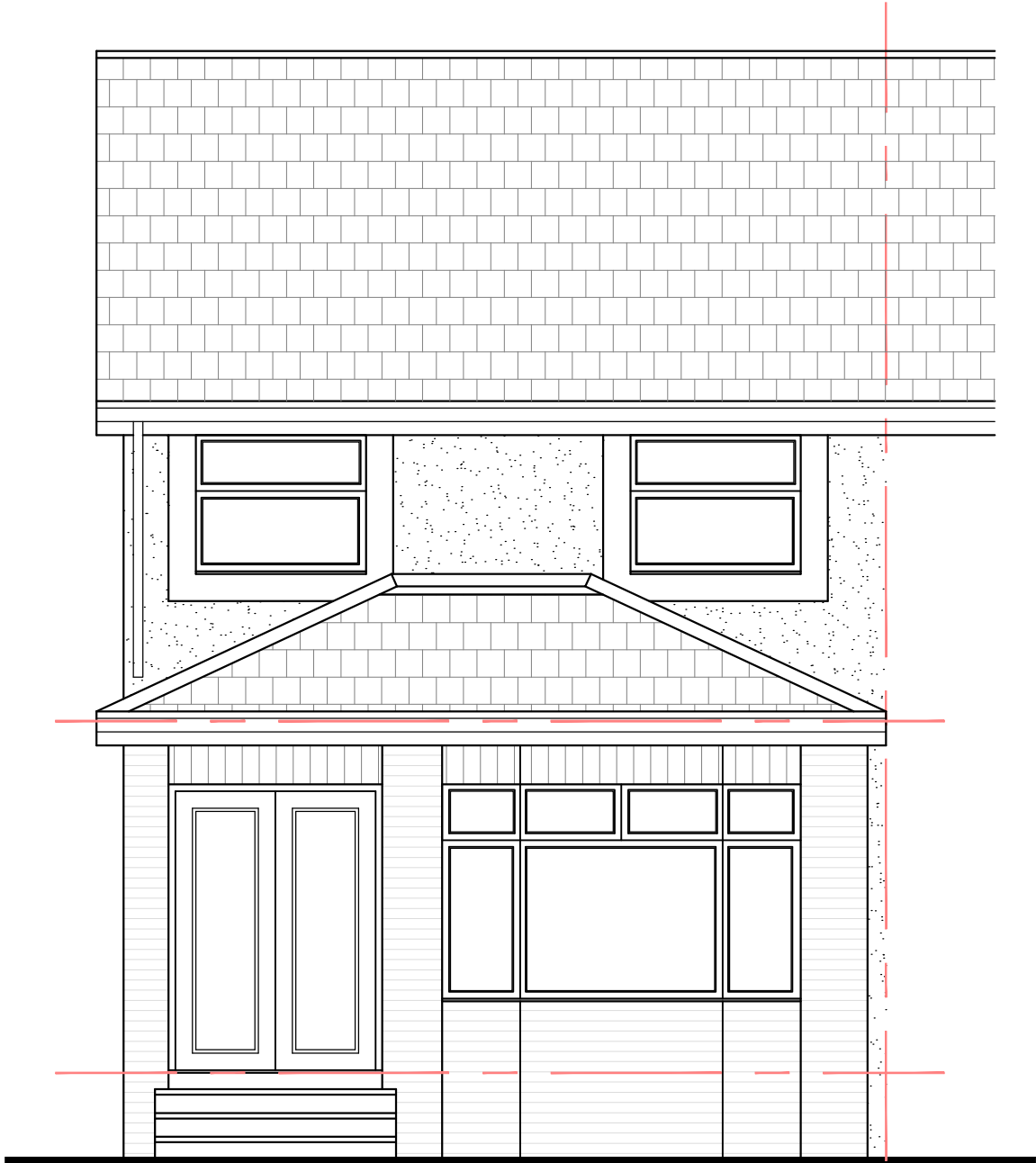
EXISTING FRONT ELEVATION - 1:50