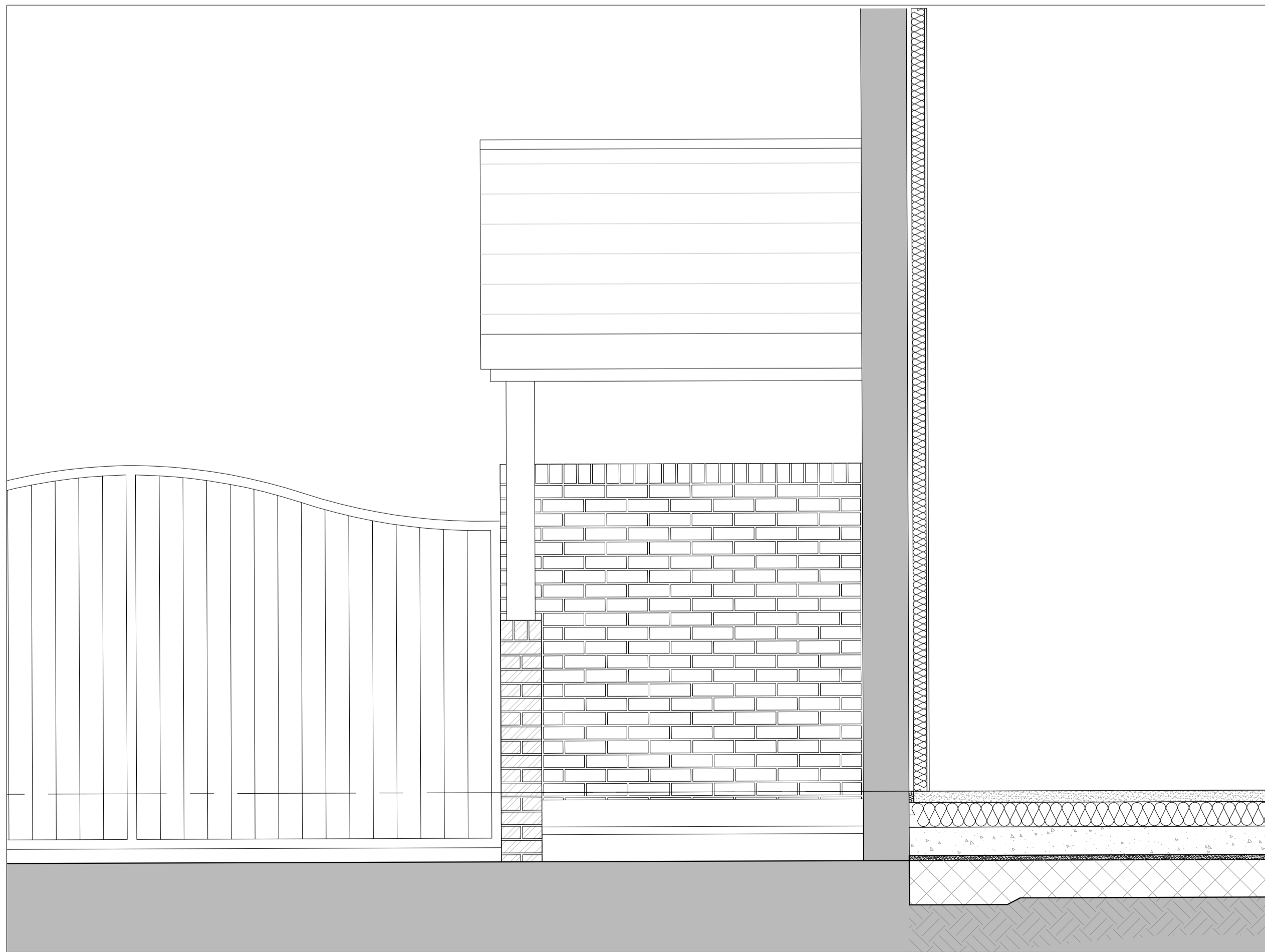
PROPOSED PORCH SIDE ELEVATION