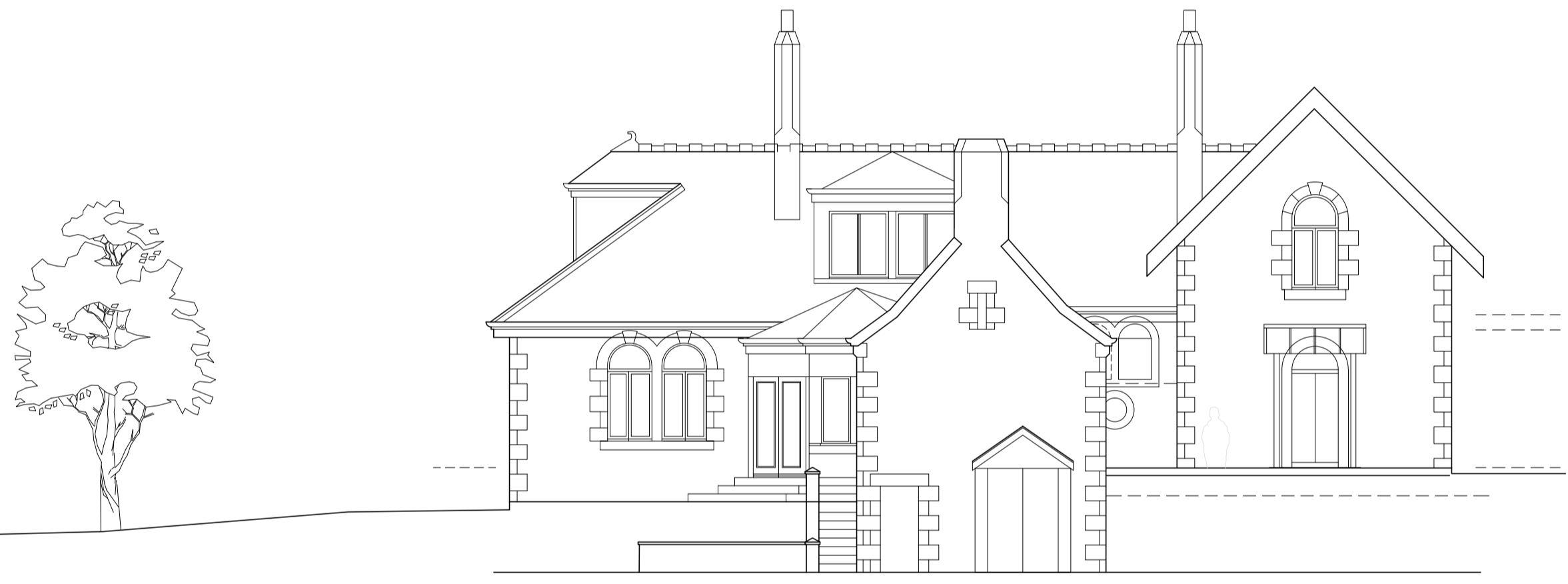
SOUTH ELEVATION AS EXISTING SCALE 1:100@A1