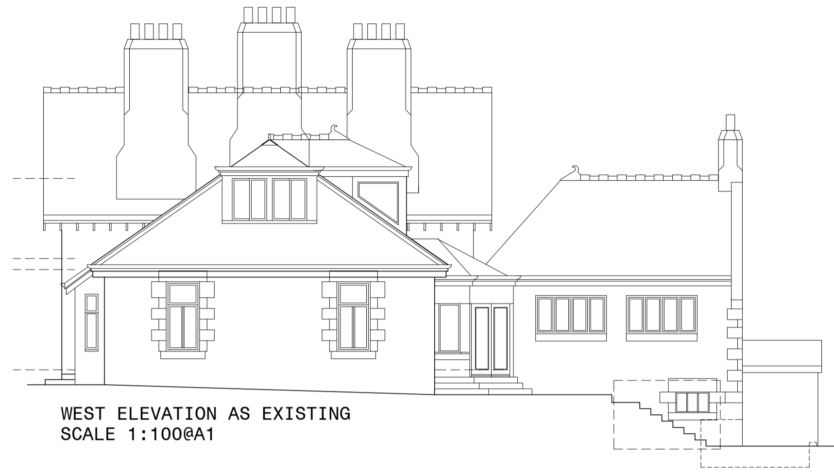
WEST ELEVATION AS EXISTING SCALE 1:100@A1