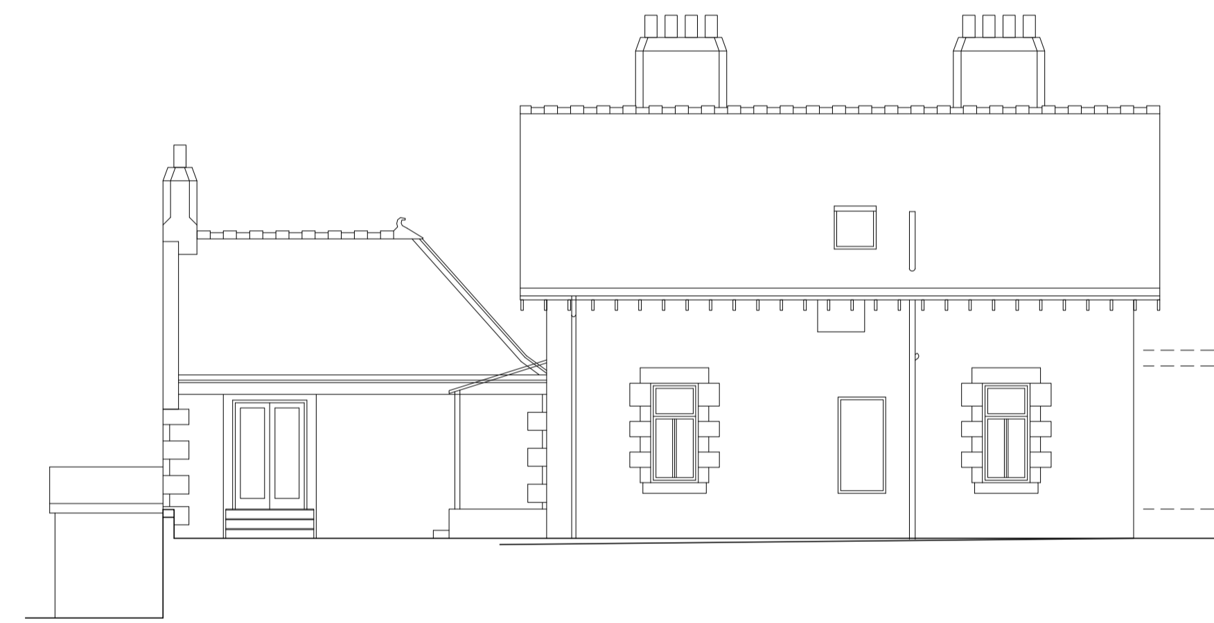
EAST ELEVATION AS EXISTING SCALE 1:100@A1