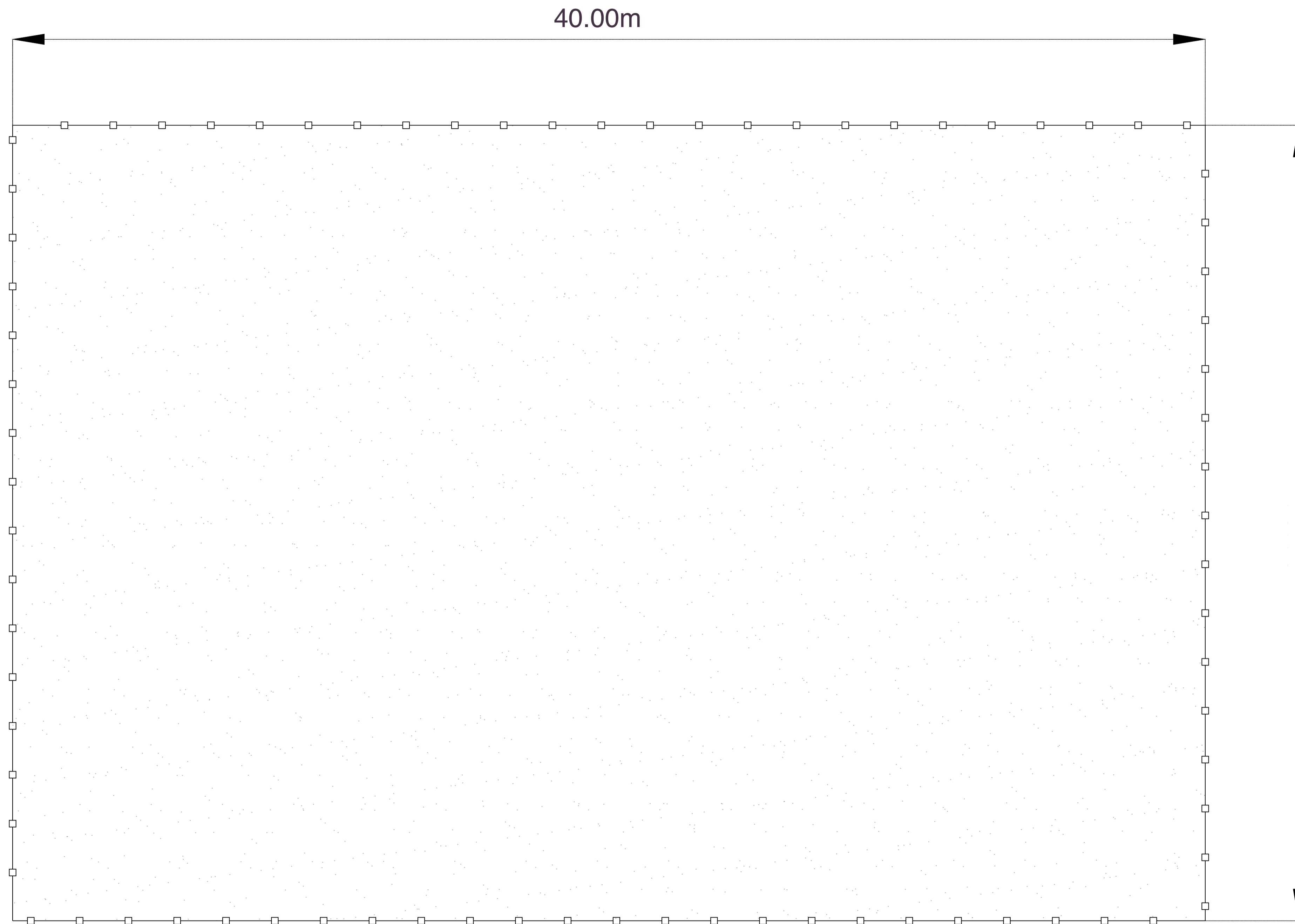
Riding Arena Floor Plan