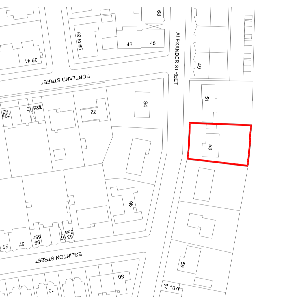
LOCATION PLAN 1:1000