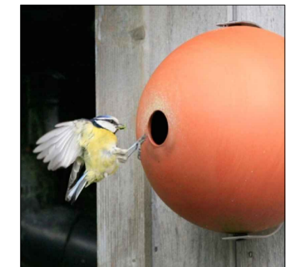
Proposed Bird Boxes to be hung from facade of house, at least 3m above ground level, facing north-east.