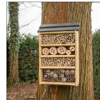
Proposed Insect Hotels to be fixed to walls at a height of 1.5m above ground level.