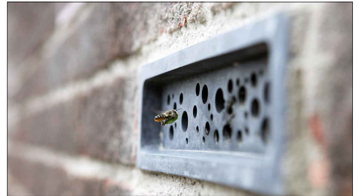
Proposed integrated bee bricks for seamless integration into new proposed retaining wall at drive.