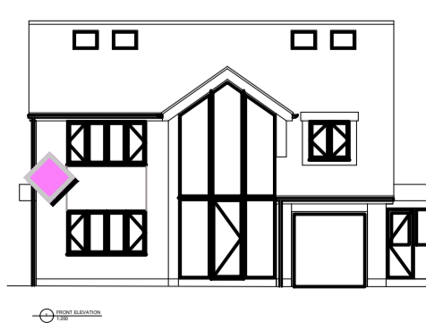
Proposed Locations Wall-mounted bird balls by Green&Blue