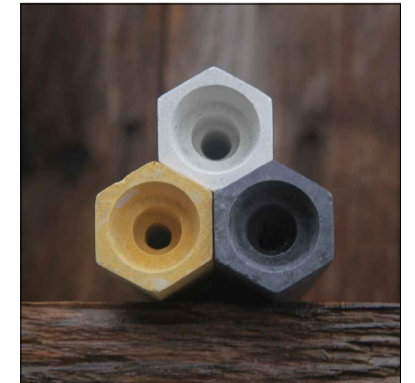
Proposed recycled concrete nesting cells for solitary bees for installation within stone walls or log piles.