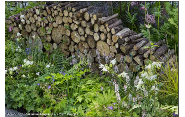
Proposed log piles constructed from dead wood from removed on-site hardwood trees. 10-15cm diameter logs with bark still attached, laid horizontally with dead leaves in a semi-tidy pyramidal pile. 2m long, 0.5m height.