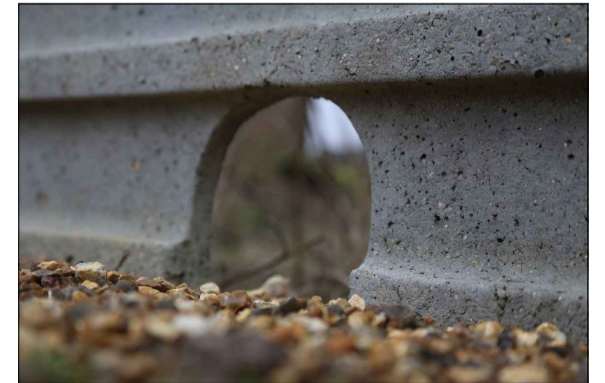
Proposed Hedgehog friendly gravel board to be installed either side of new fence installation at rear garden boundary.