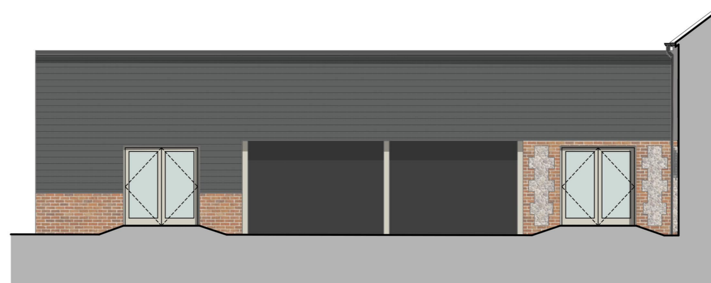
North Courtyard Elevation