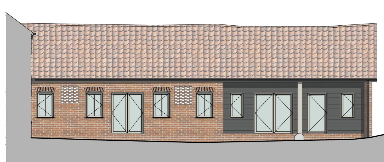
South Courtyard Elevation