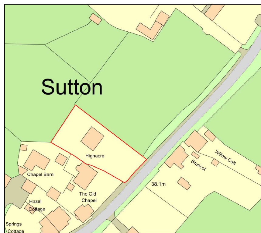
1:1250 LOCATION PLAN