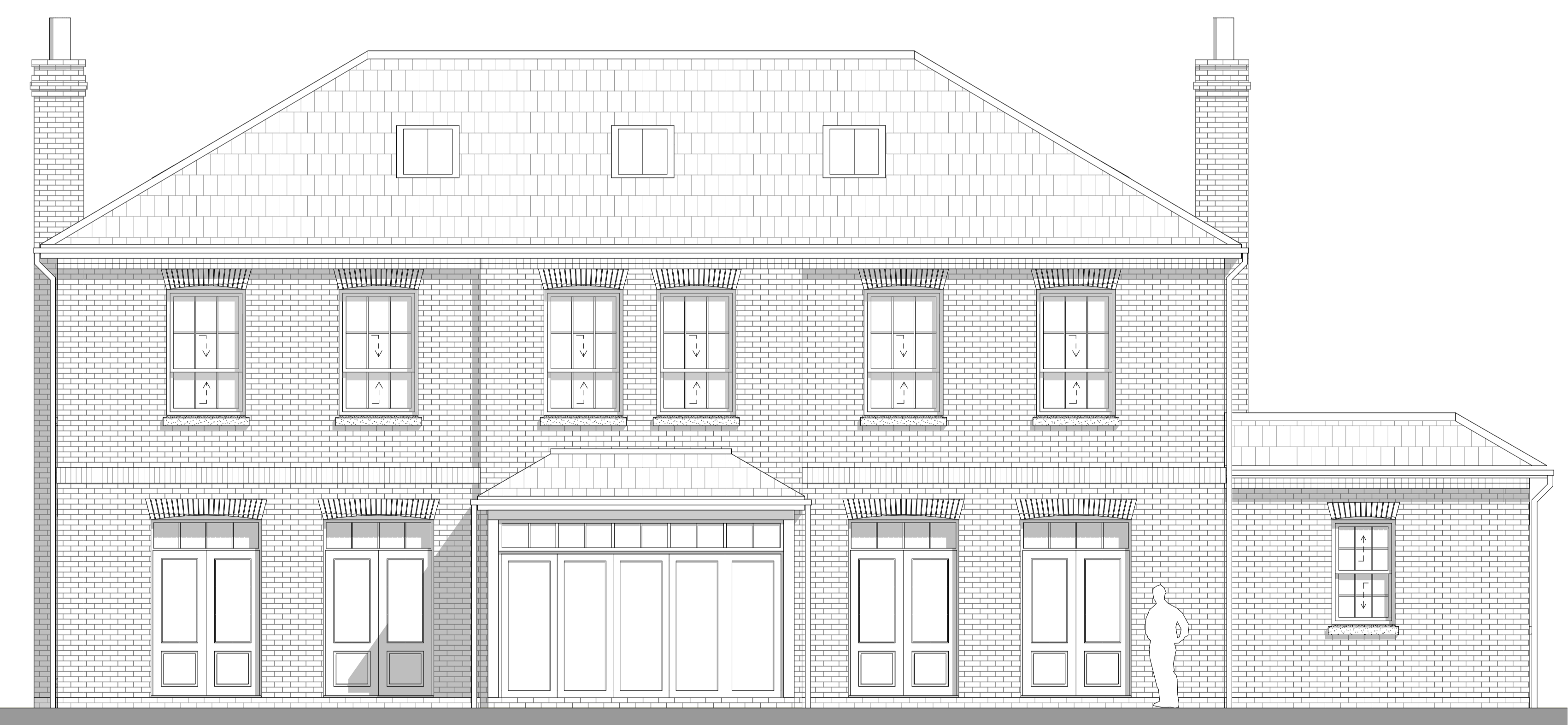
Rear Elevation 1:50 @ A1