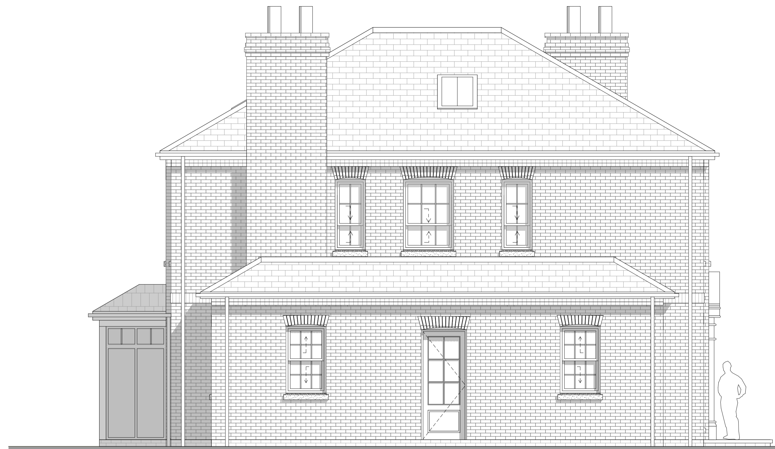
Side Elevation 1:50 @ A1