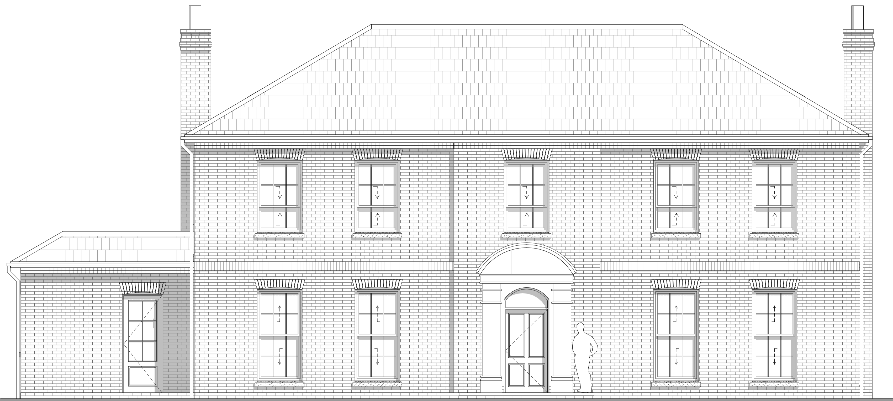
Front Elevation 1:50 @ A1

Note: This document and its design content is copyright ©. It shall be used in accordance with all other conditions of the original contract. It shall not be used for any other project without the written consent of the originator. It shall not be used for any other project without the written consent of the originator. It shall not be used for any other project without the written consent of the originator.