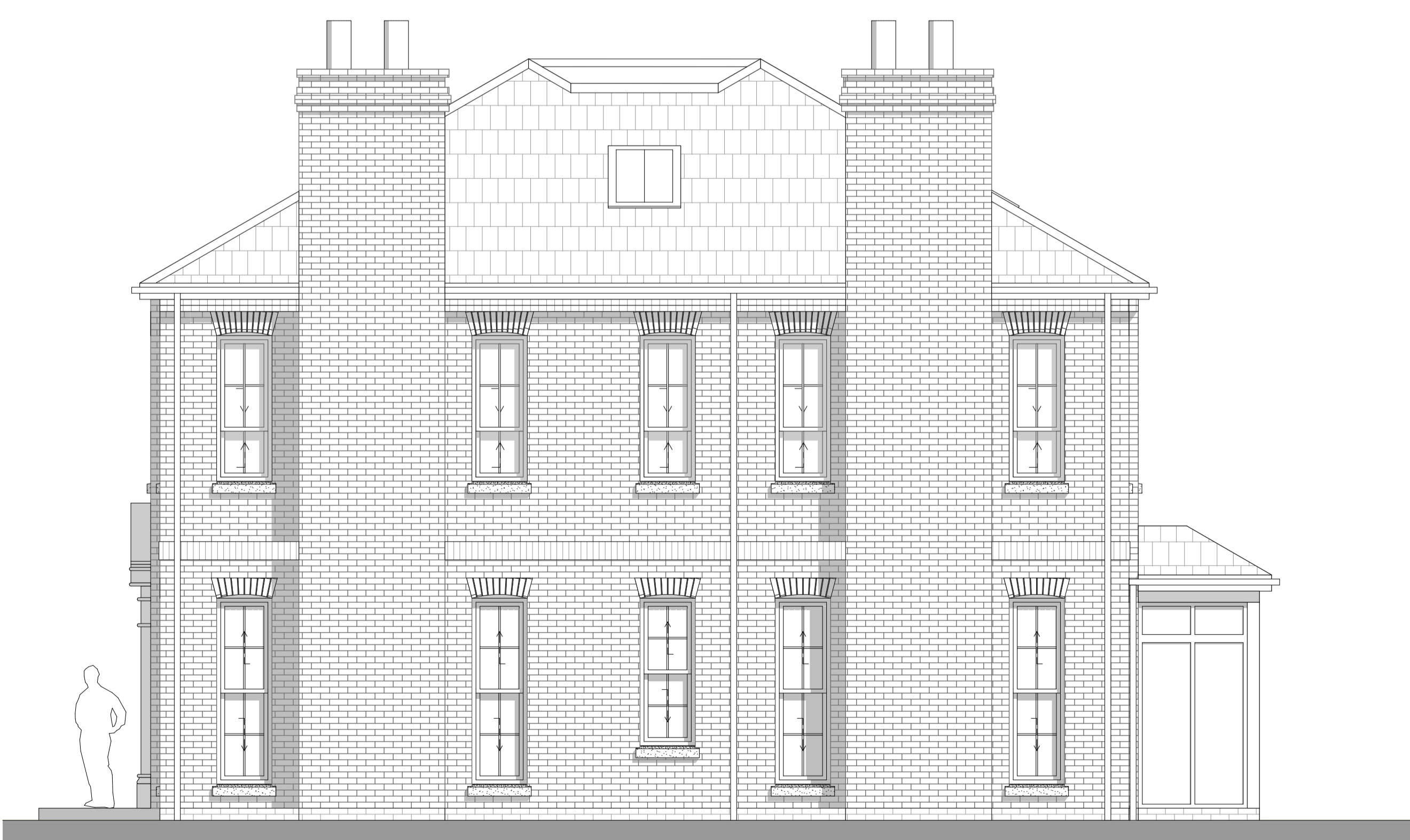
Side Elevation 1:50 @ A1