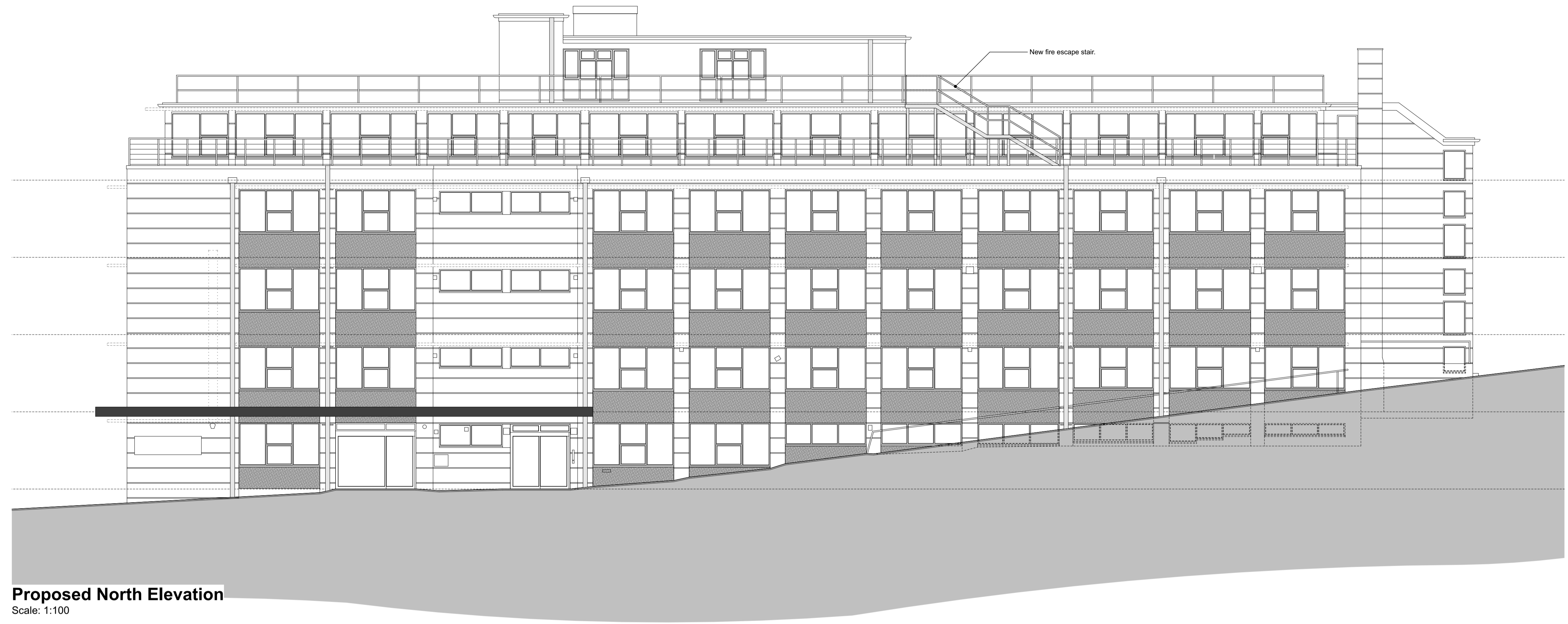
Proposed North Elevation Scale: 1:100