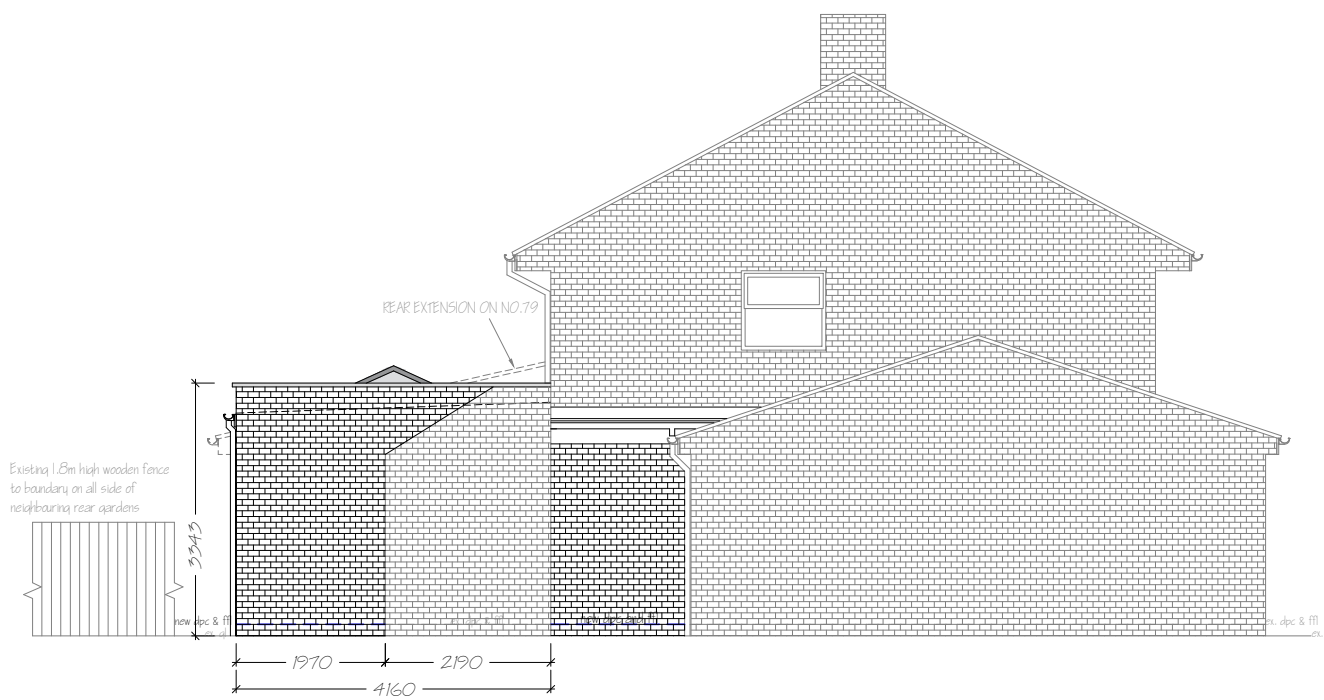
PROPOSED GABLE ELEVATION