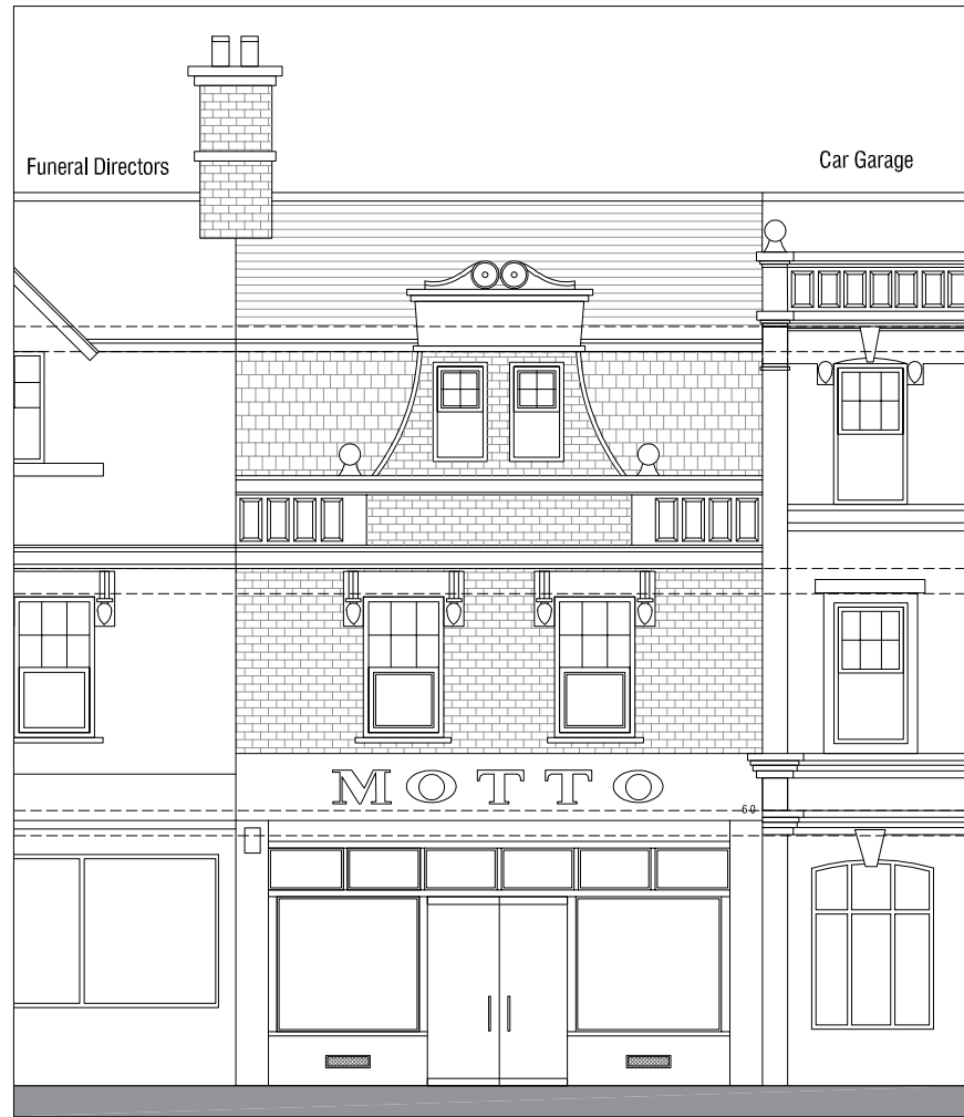
01 - Existing Front Elevation