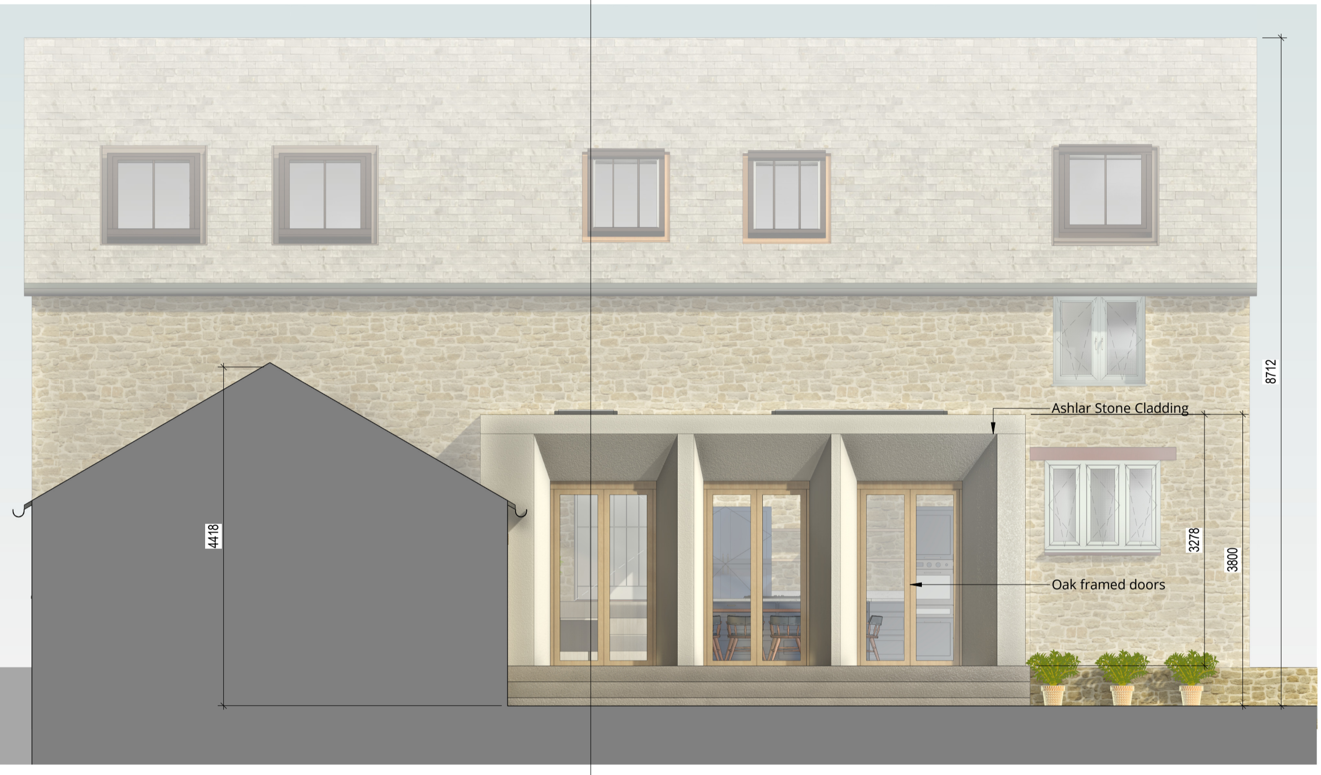
1 Rear Elevation as Proposed CW 08 70 02 1:50