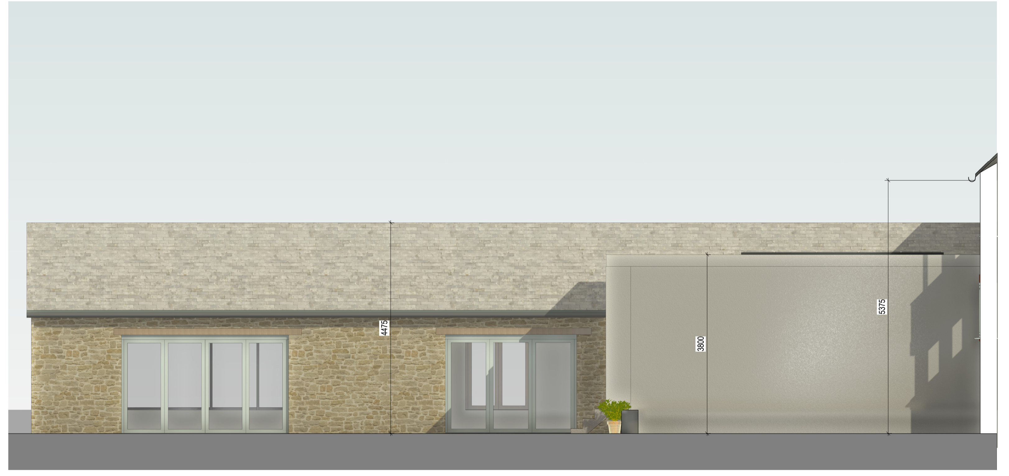
2 Side Elevation as Proposed CW 08 70 02 1:50