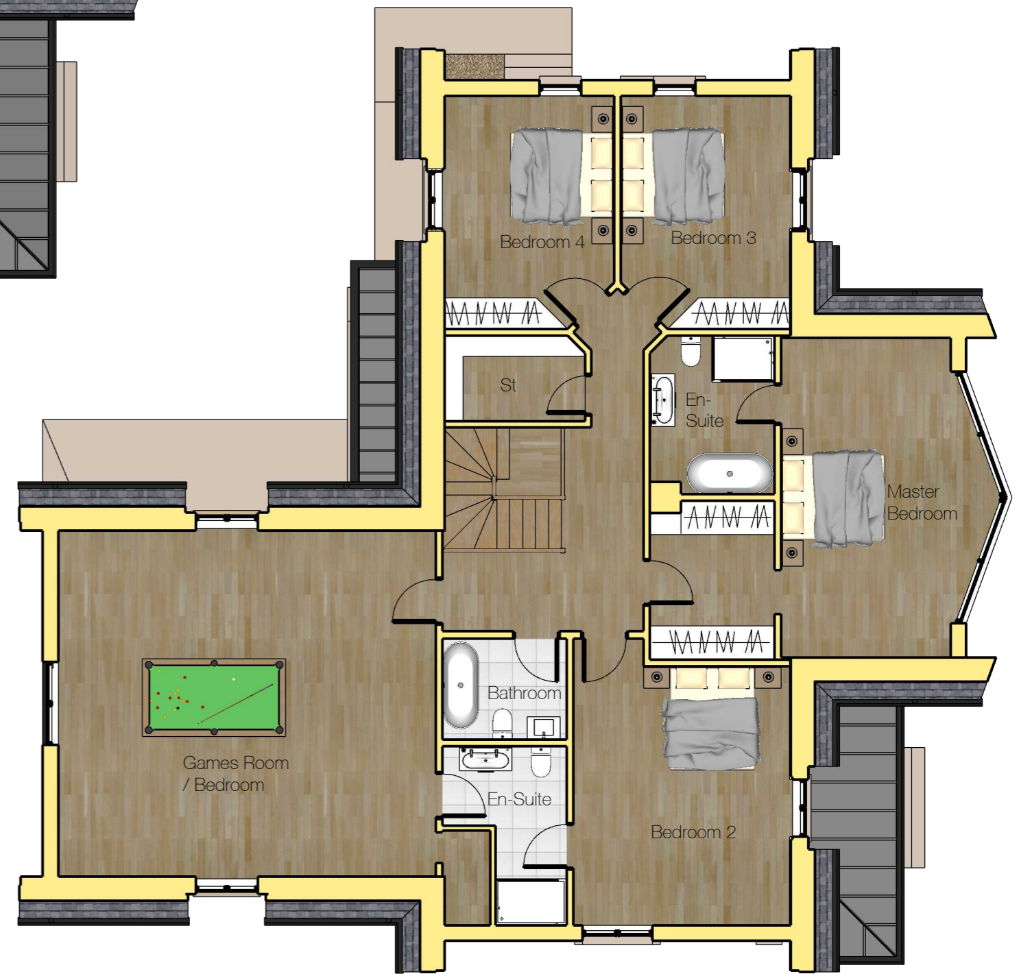
FIRST FLOOR PLAN AS PROPOSED 1:100 @A2