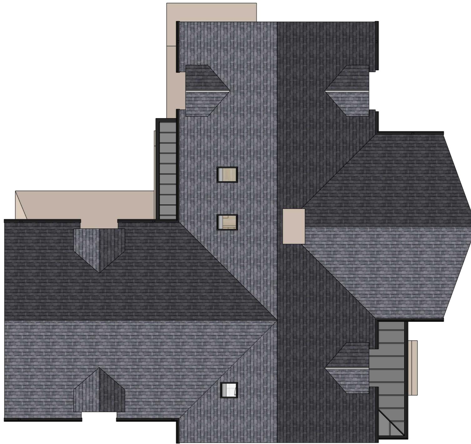
ROOF PLAN AS PROPOSED 1:100 @A2