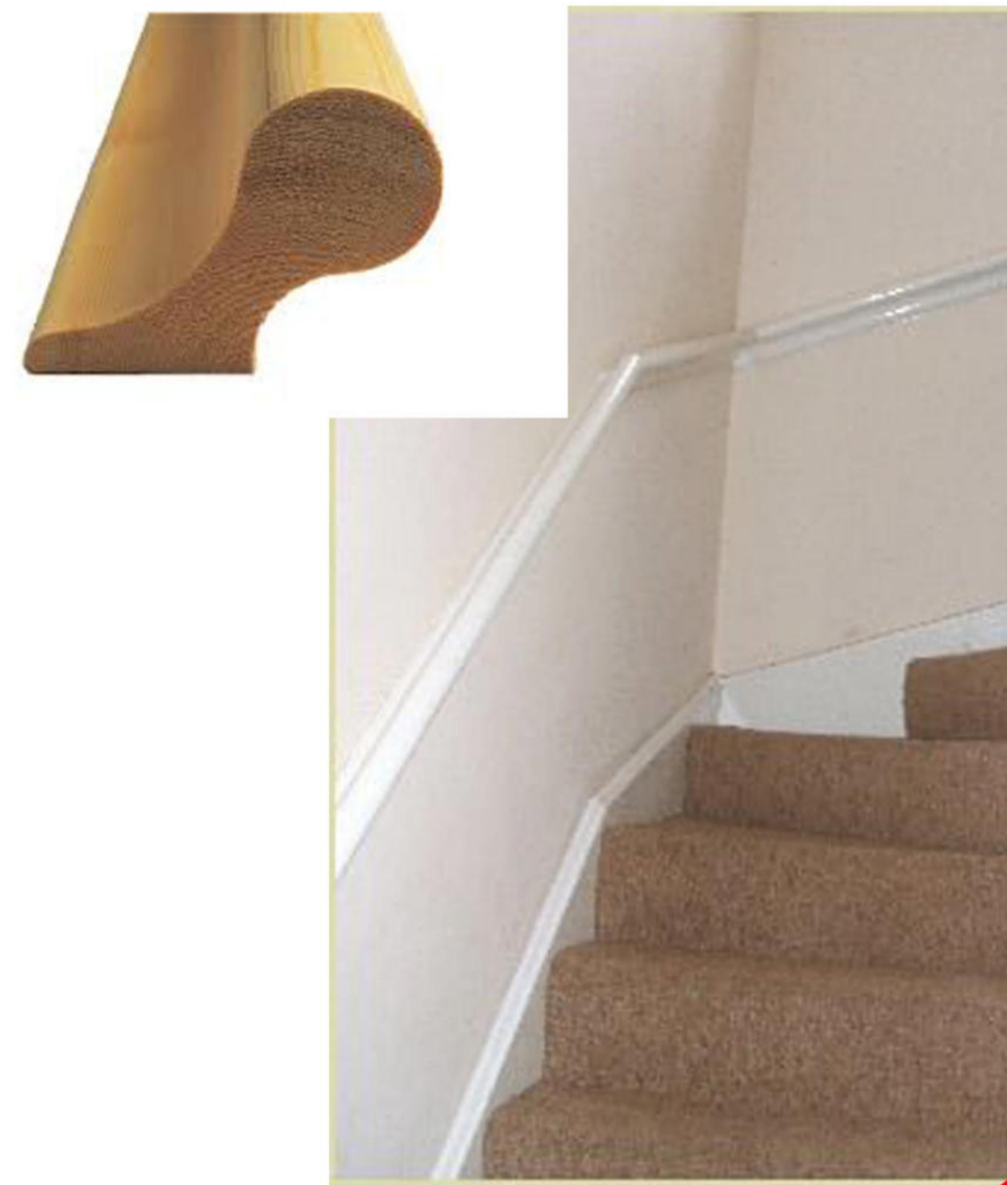
Proposed Stairflight with Pigsear Handrail