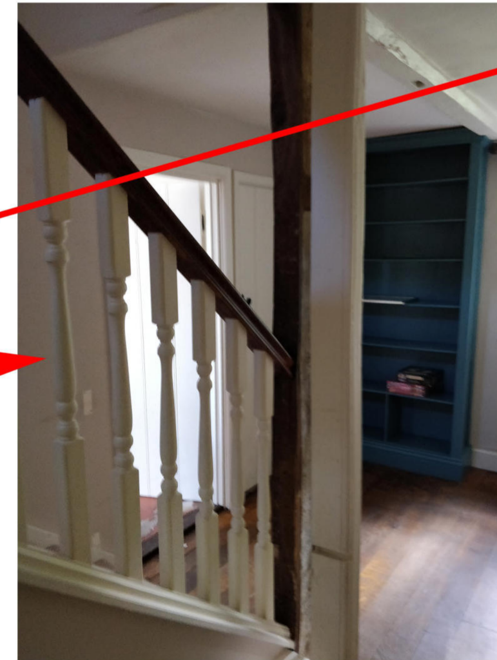
Existing Baluster (To be removed)