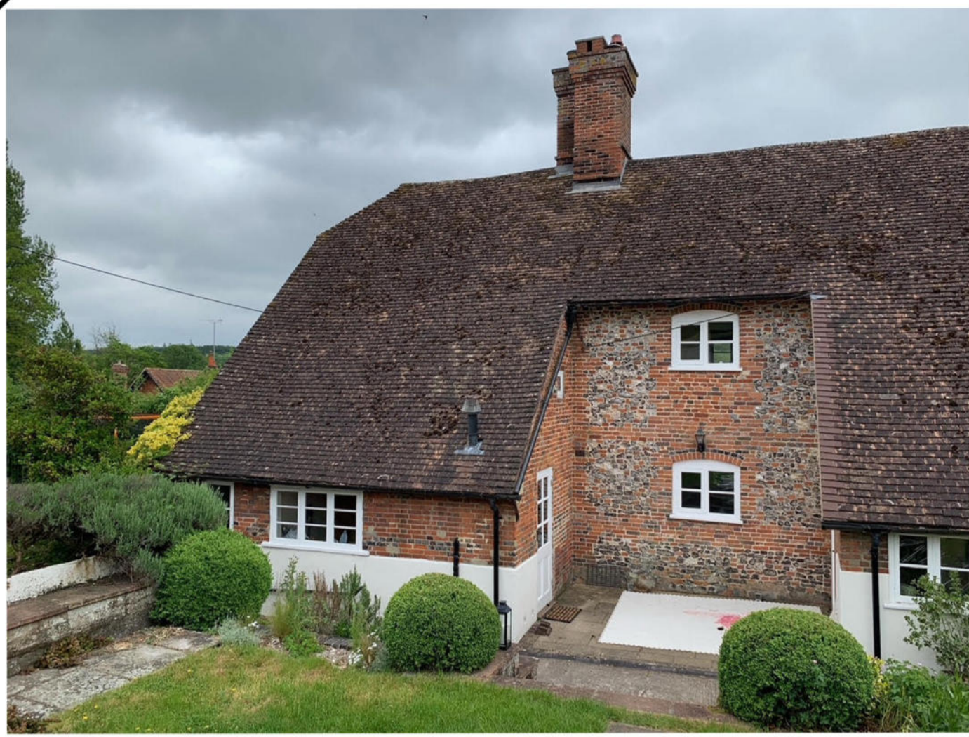
Image - Rear Elevation