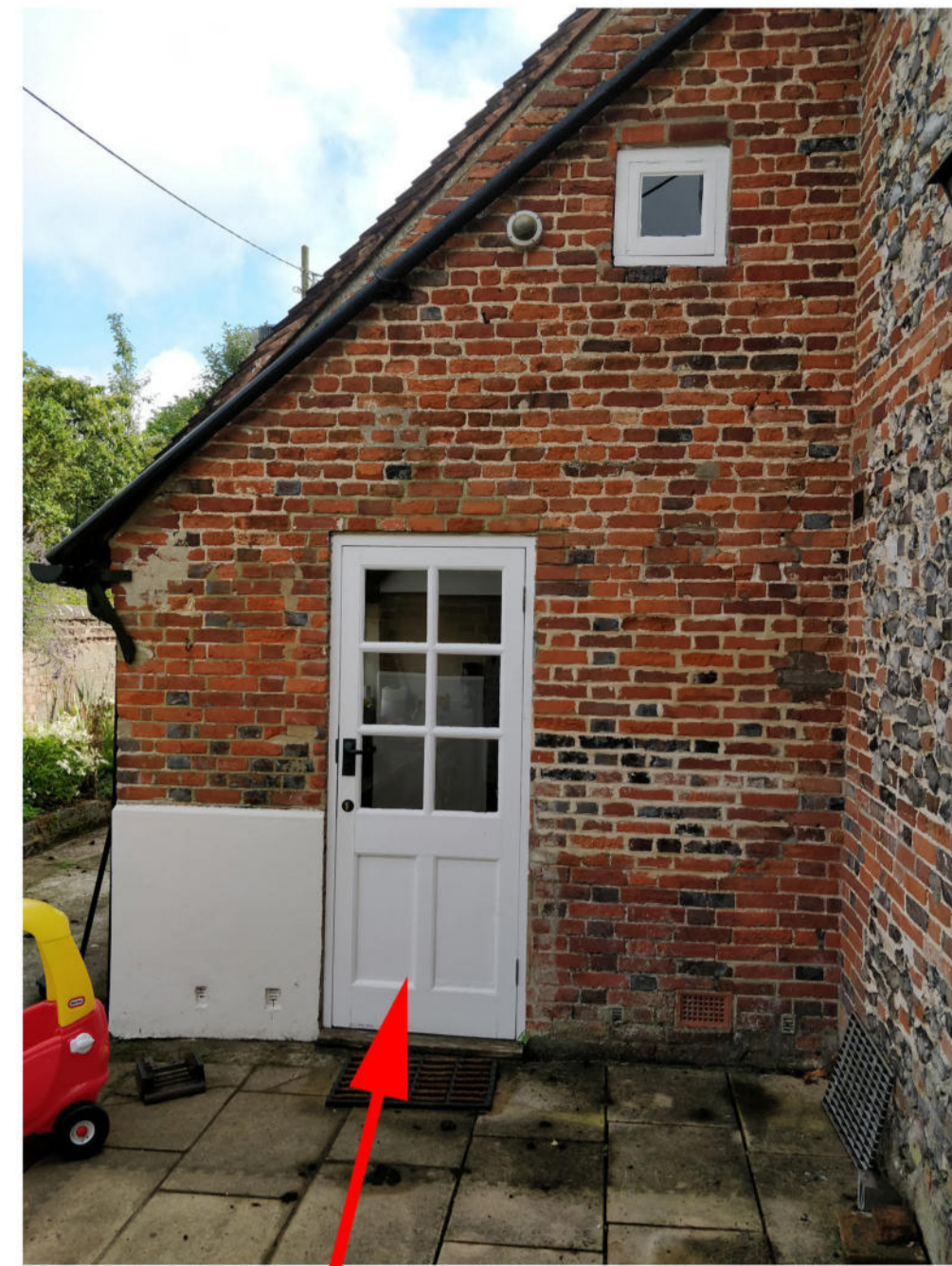
Existing door to be infilled (Leaving recess)