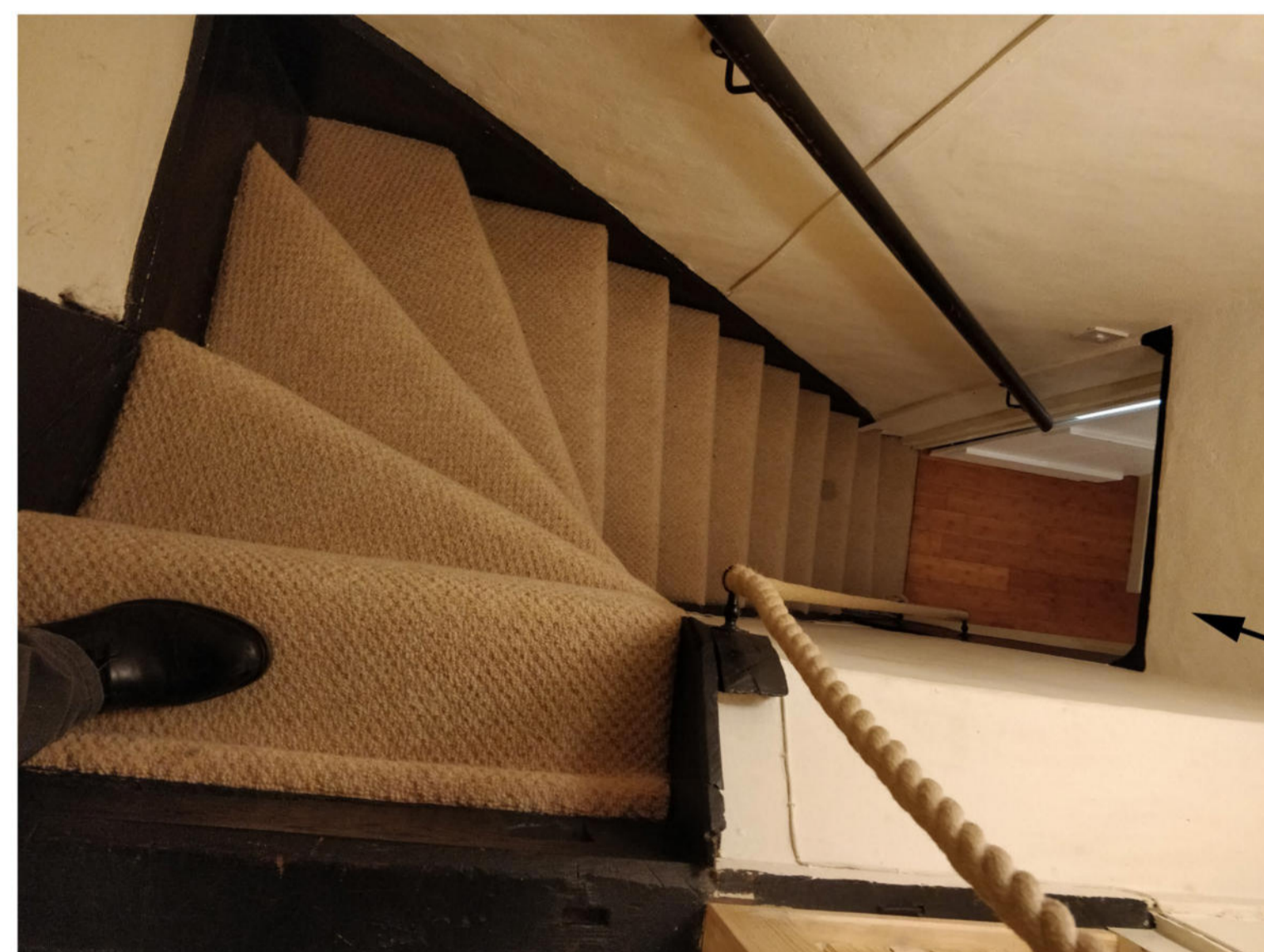
Existing Stairflight to Attic to be retained as storage (With new Attic Floor over)