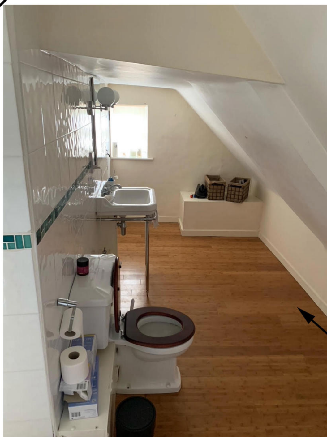
Dressing area (Sanitary Fittings removed)