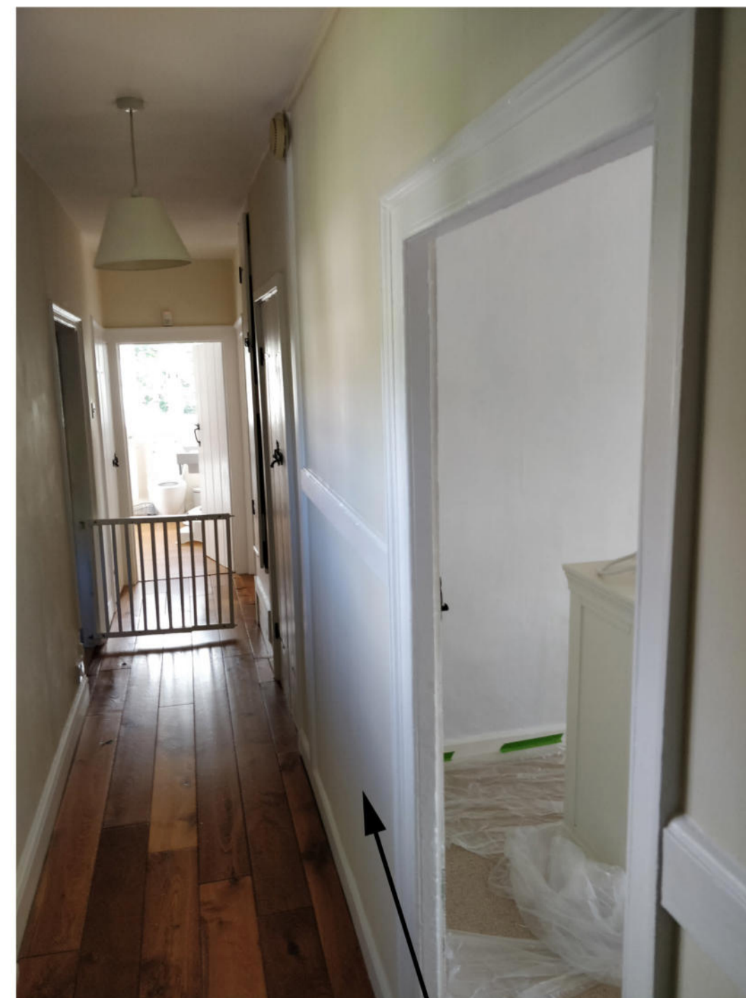
Existing Timber Screen to Corridor is Retained