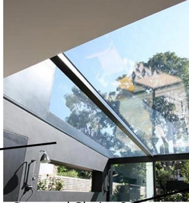
Proposed Glazing System