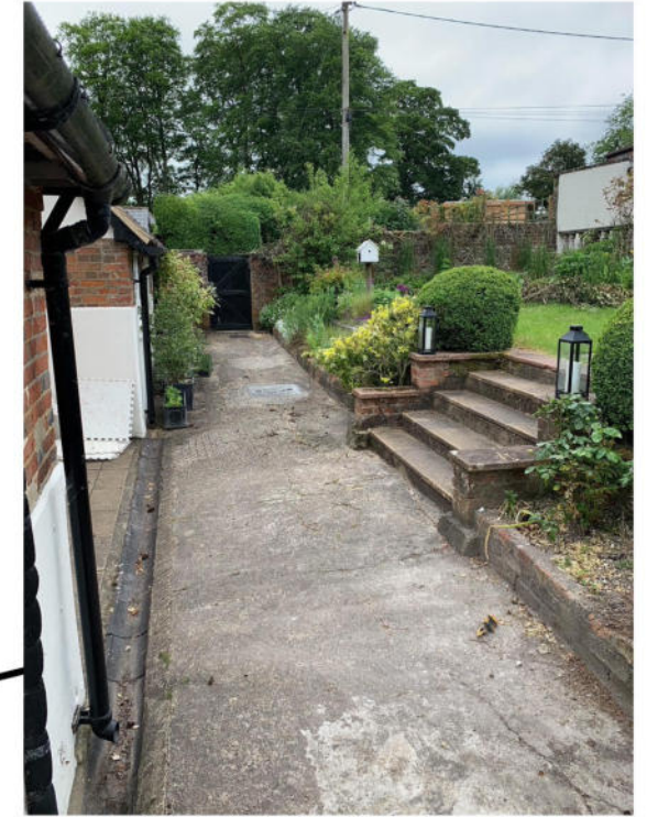
Existing Levels Reduced