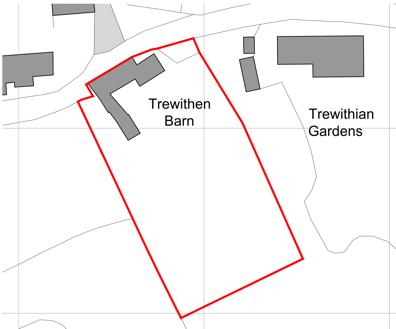
02 Existing Block Plan 1:500