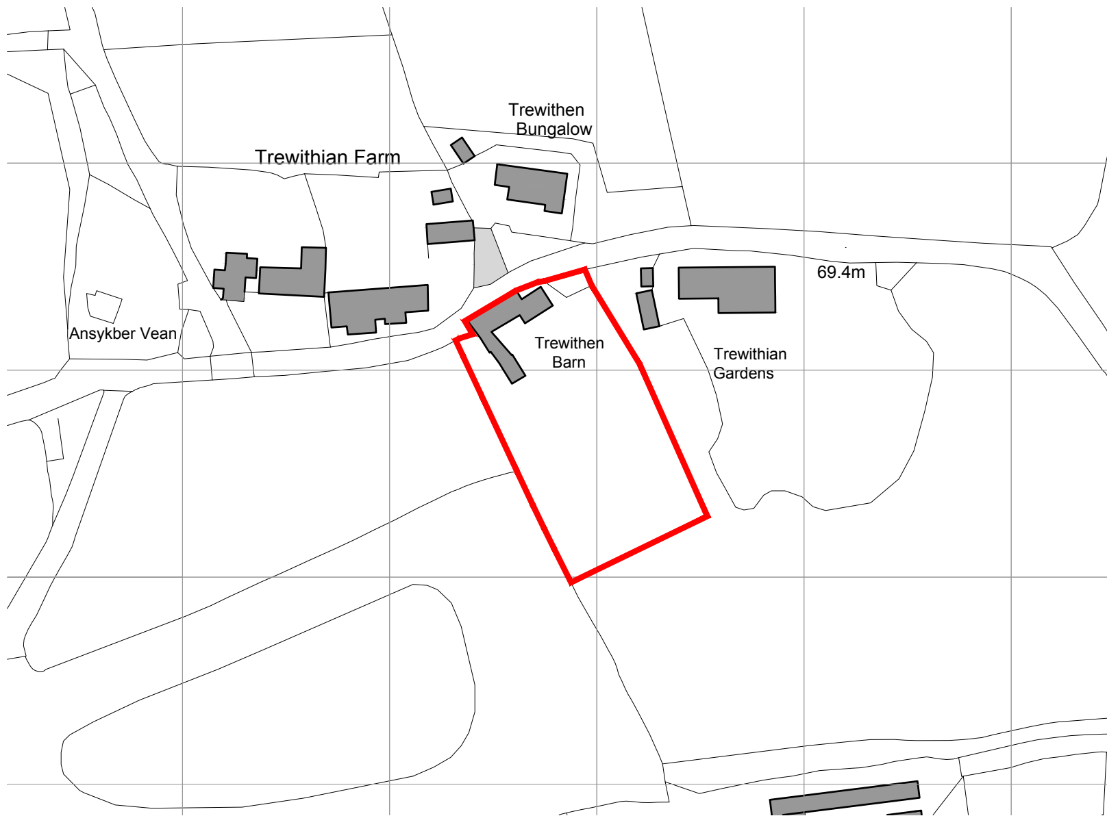
01 Existing Location Plan 1:1250