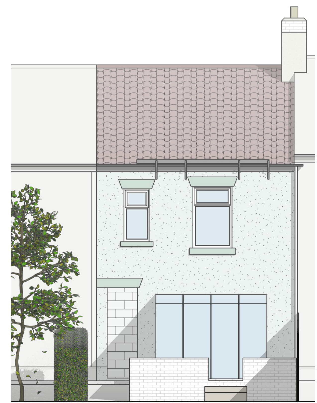
2 Existing Elevation Facing South 1:50