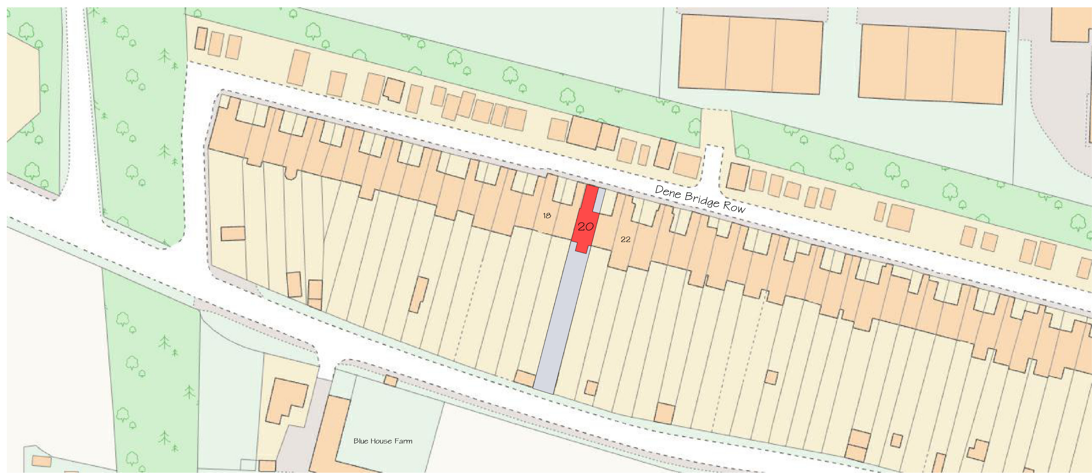
① Existing Block Plan 1:500