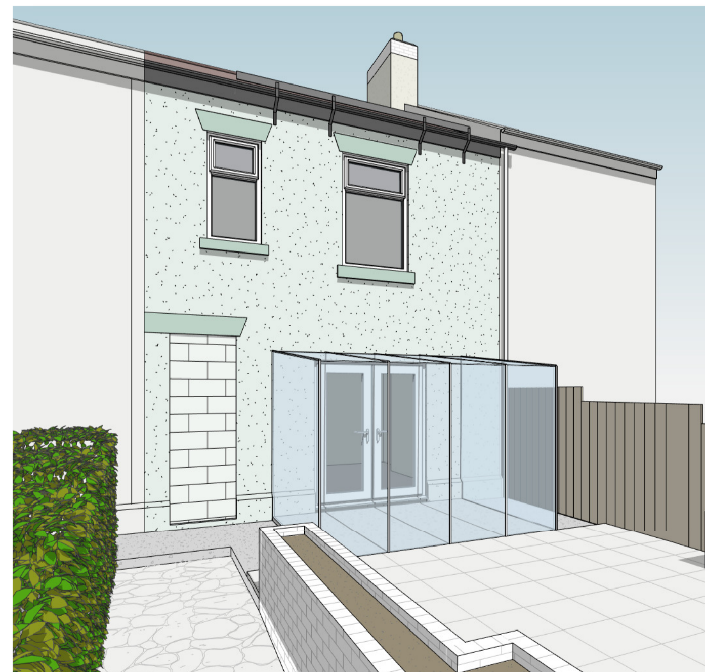
④ Existing 3D View 4