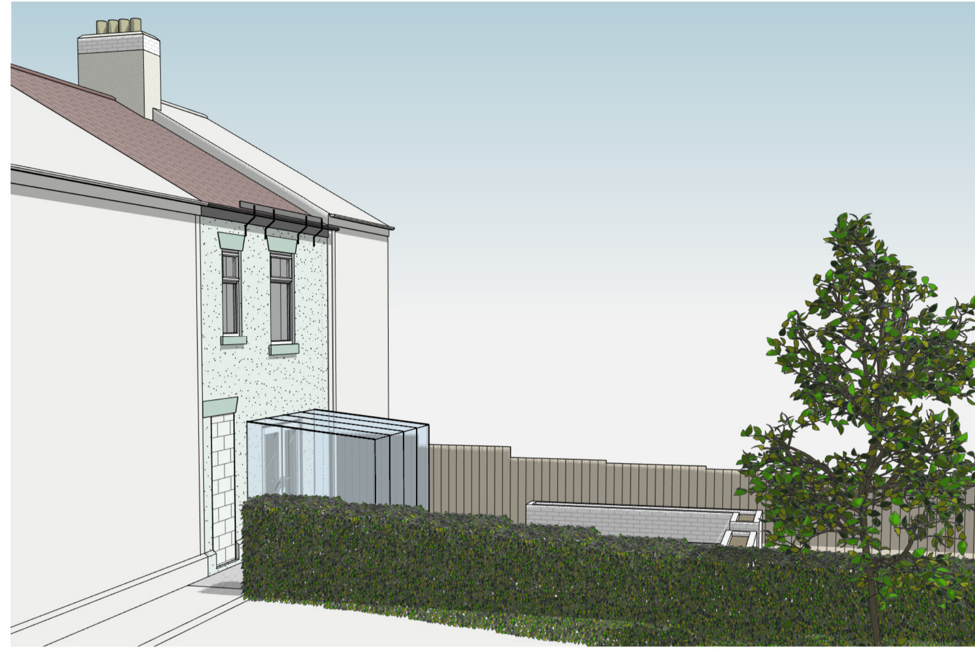
② Existing 3D View 2