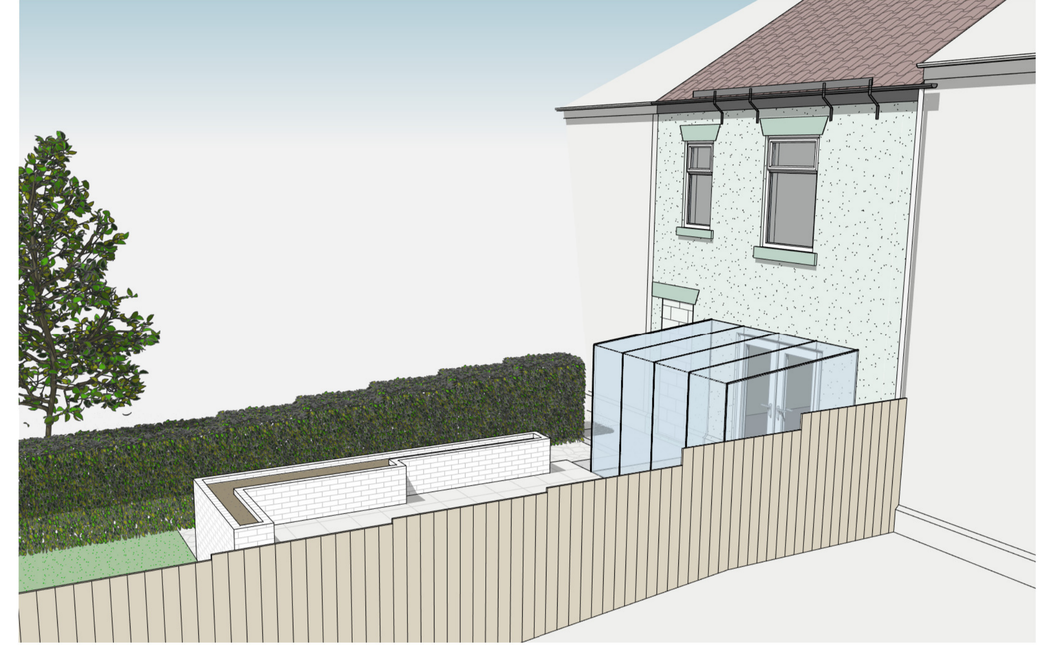
③ Existing 3D View 3