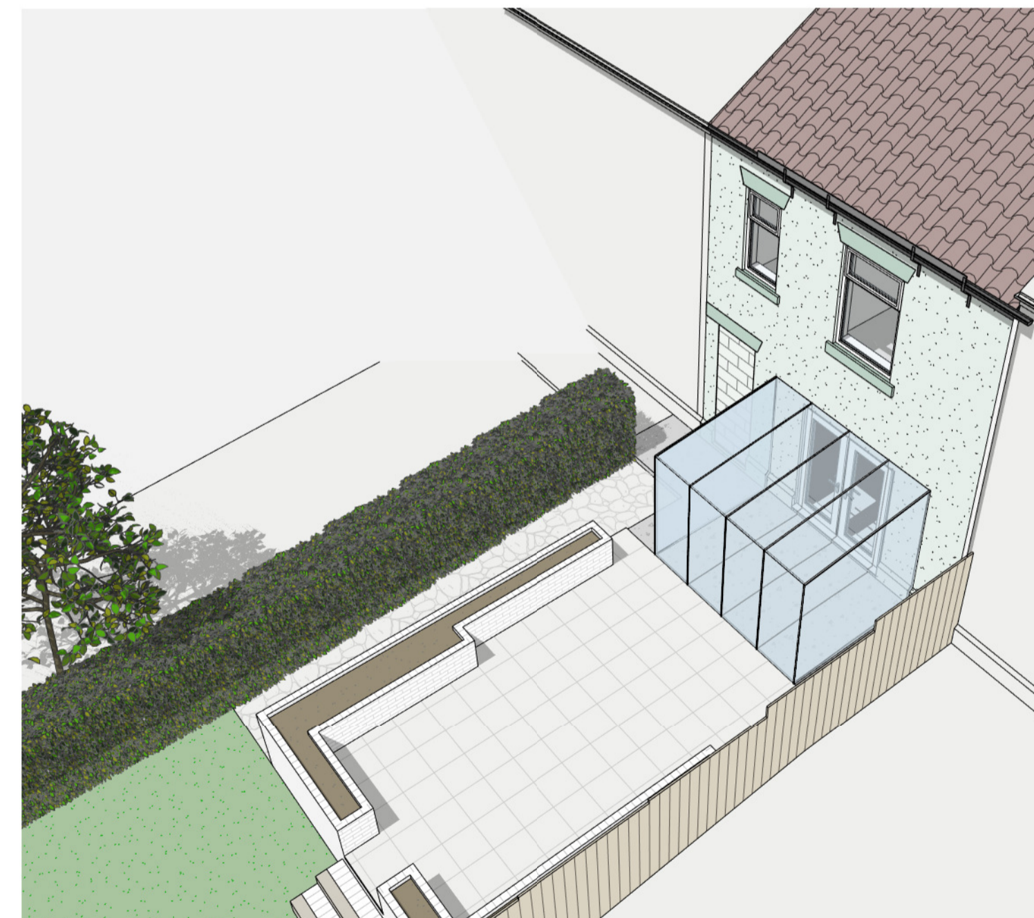
⑤ Existing 3D View 5