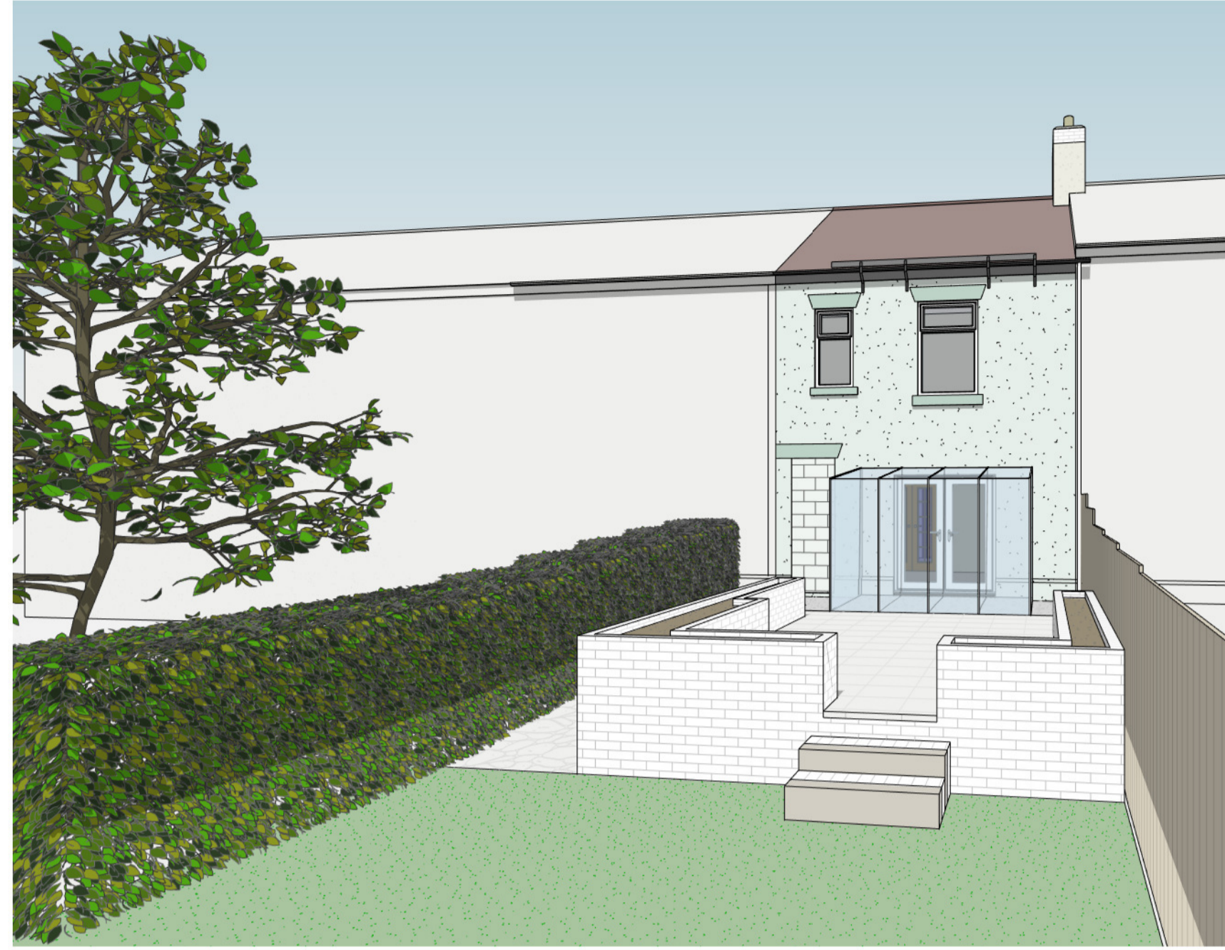
① Existing 3D View 1