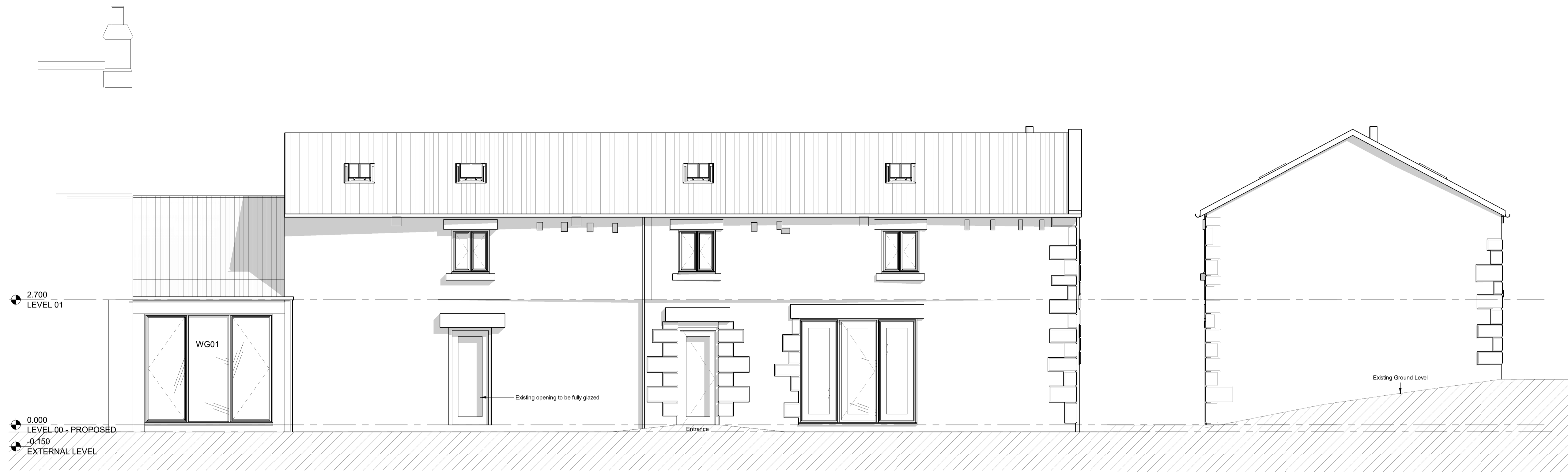
SOUTH ELEVATION SCALE: 1 : 50