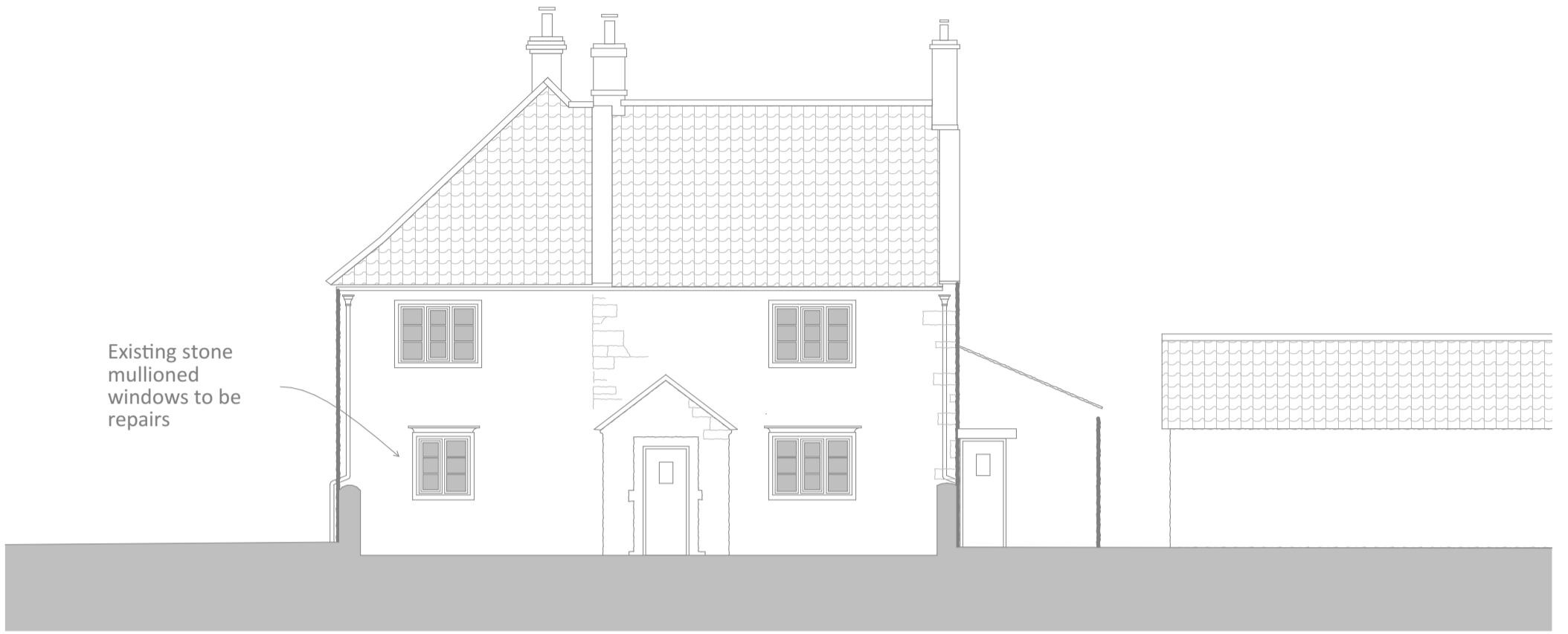
SOUTH (FRONT) ELEVATION