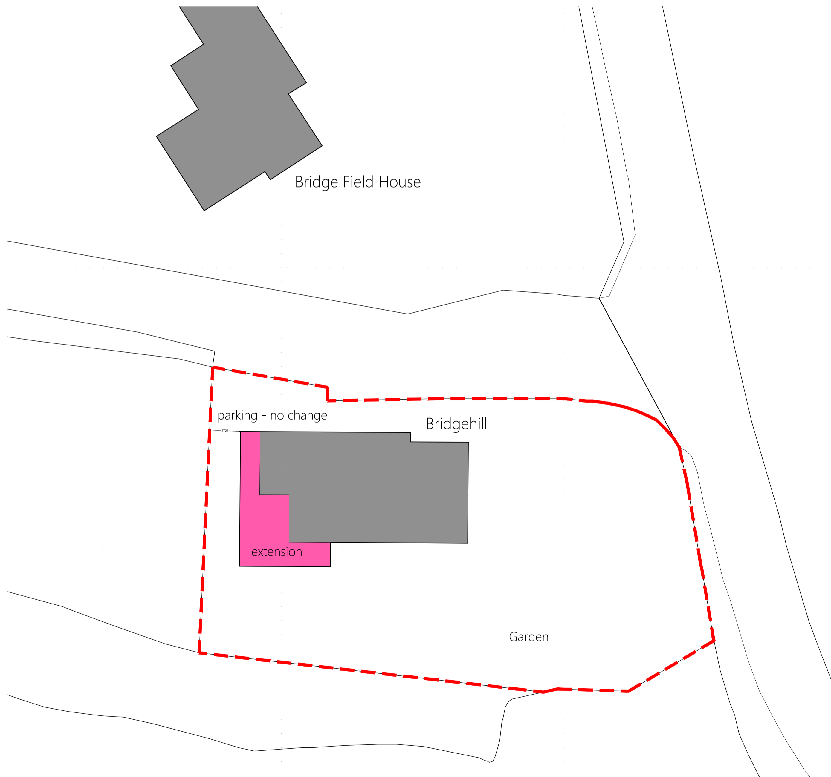
Site Layout Plan 1:200 @ A1